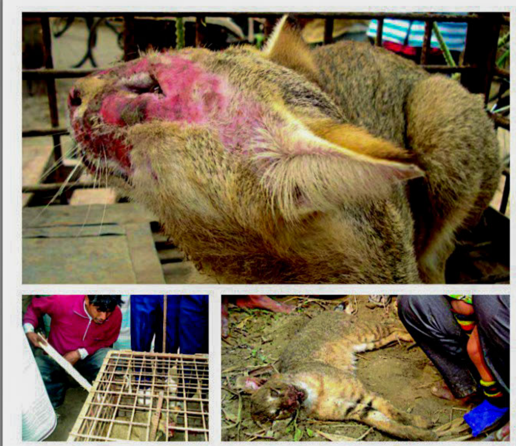
Anti-clockwise from top, a wild cat locally known as Bon Biral is trapped in Sabujpara area of Nilphamari town Saturday night. People poke the caged animal. Corpse of another wild cat killed by locals of Kaniakhata at sadar upazila the same night. Wildlife Preservation Act clearly prohibits catching, harassing and killing of any wild animal. The photos were taken yesterday.