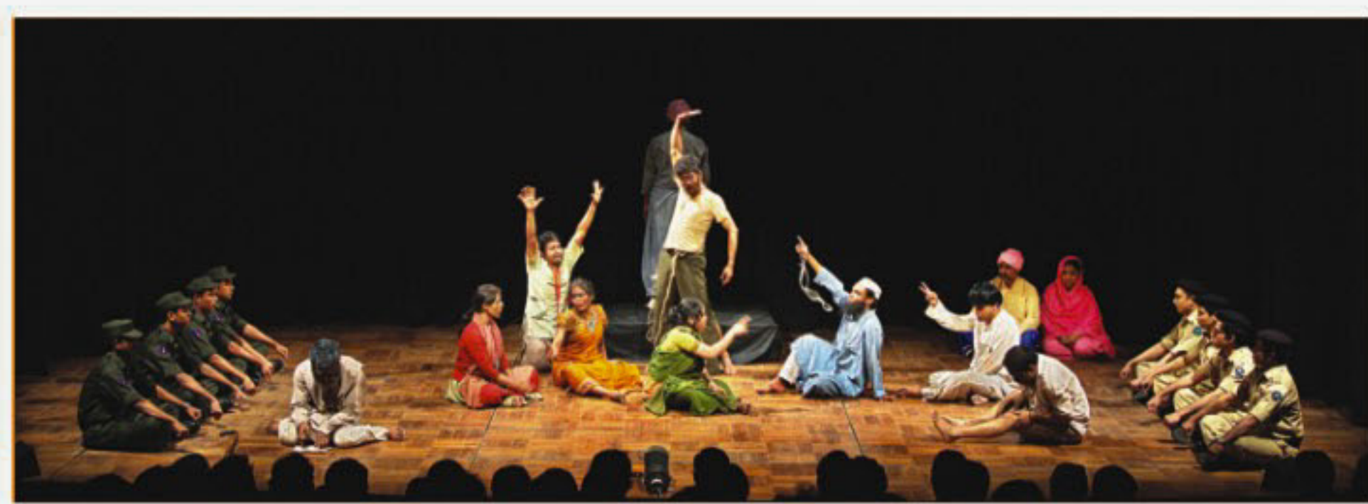
From left: Scenes from "Socrates-er Jobanbondi", "Bhager Manush" and "Prakrito Purangana" (below).