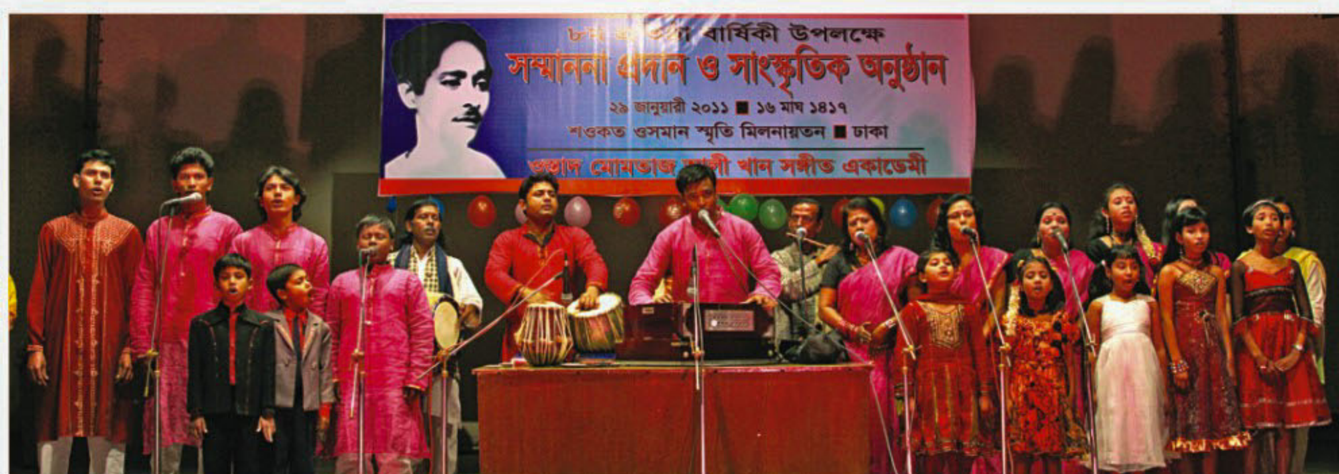
Celebrating -- in rhythm and song.