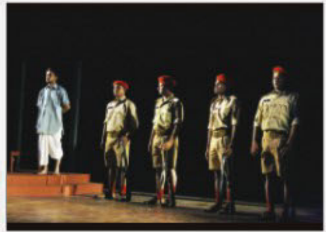
Synopsis: The play is based on Rabindranath Tagore's story with the same title.