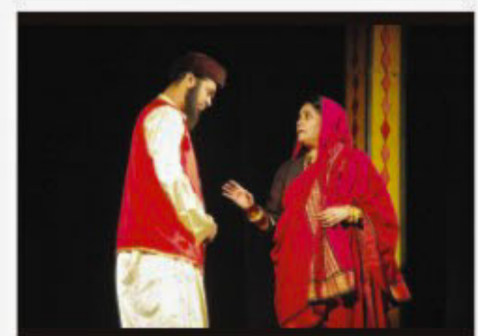
Synopsis: The play highlights the age-old conflict between religion and humanity.