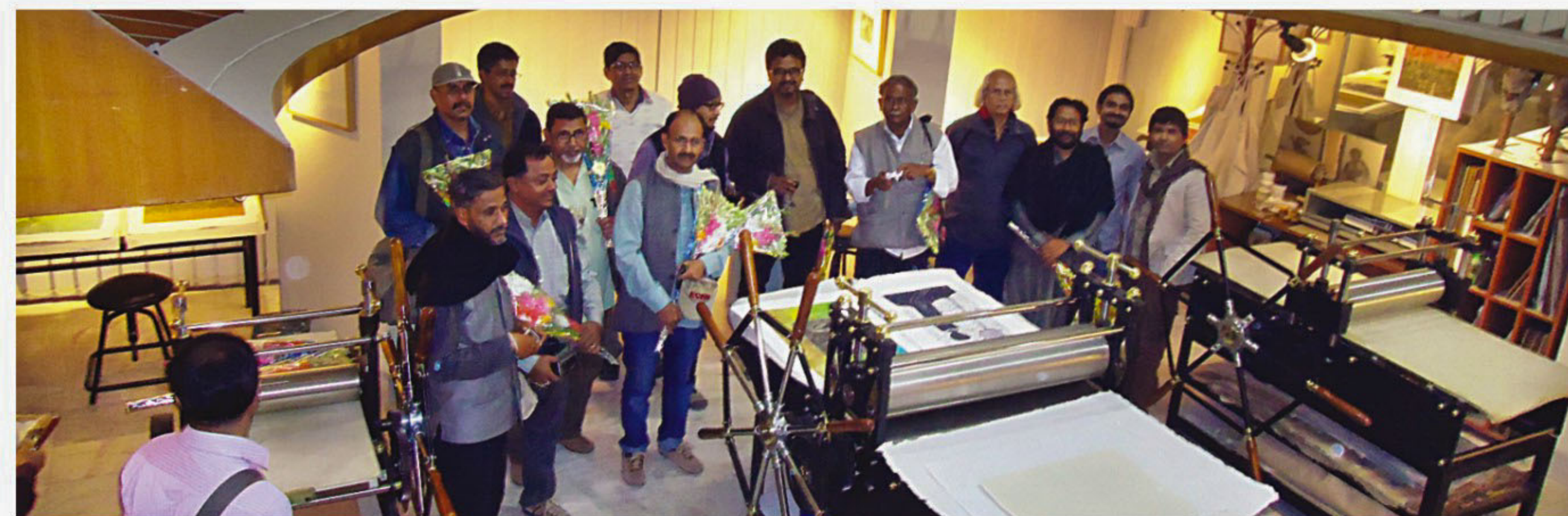
The visiting faculty members of Visva Bharati were accorded reception by Cosmos-Atelier71.