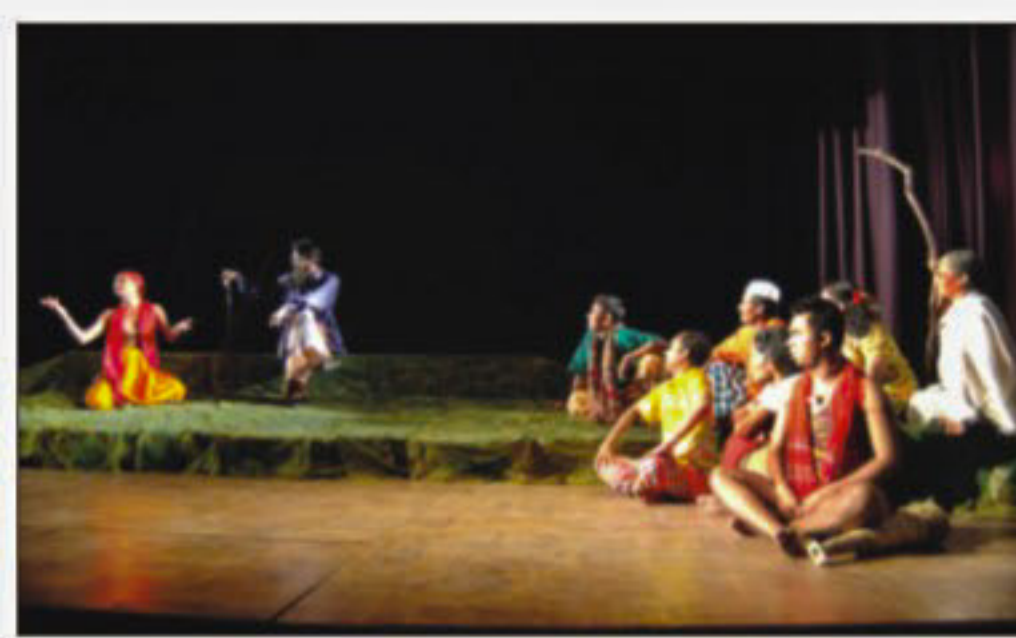
"Joi Balika" (50th show) Venue: National Theatre Hall Troupe: Padatik Natya Sangsad Bangladesh Playwright: Masum Reza Director: Shamsul Alam Bakul

On the sixth day (January 30) of The Daily Star-BGTF Theatre Festival, the following plays will be staged at 6:30pm at the Bangladesh Shilpakala Academy: