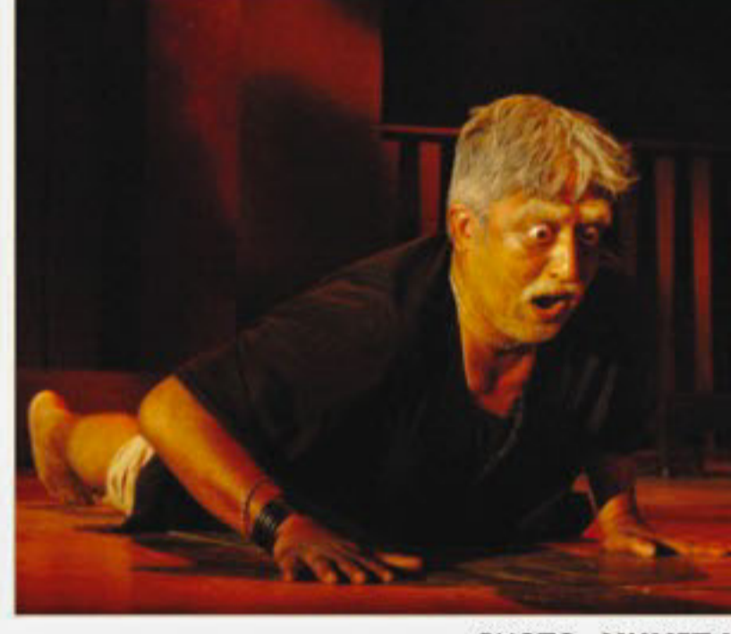
A scene from "Kathal Bagan".

Three adaptations staged on the fourth day