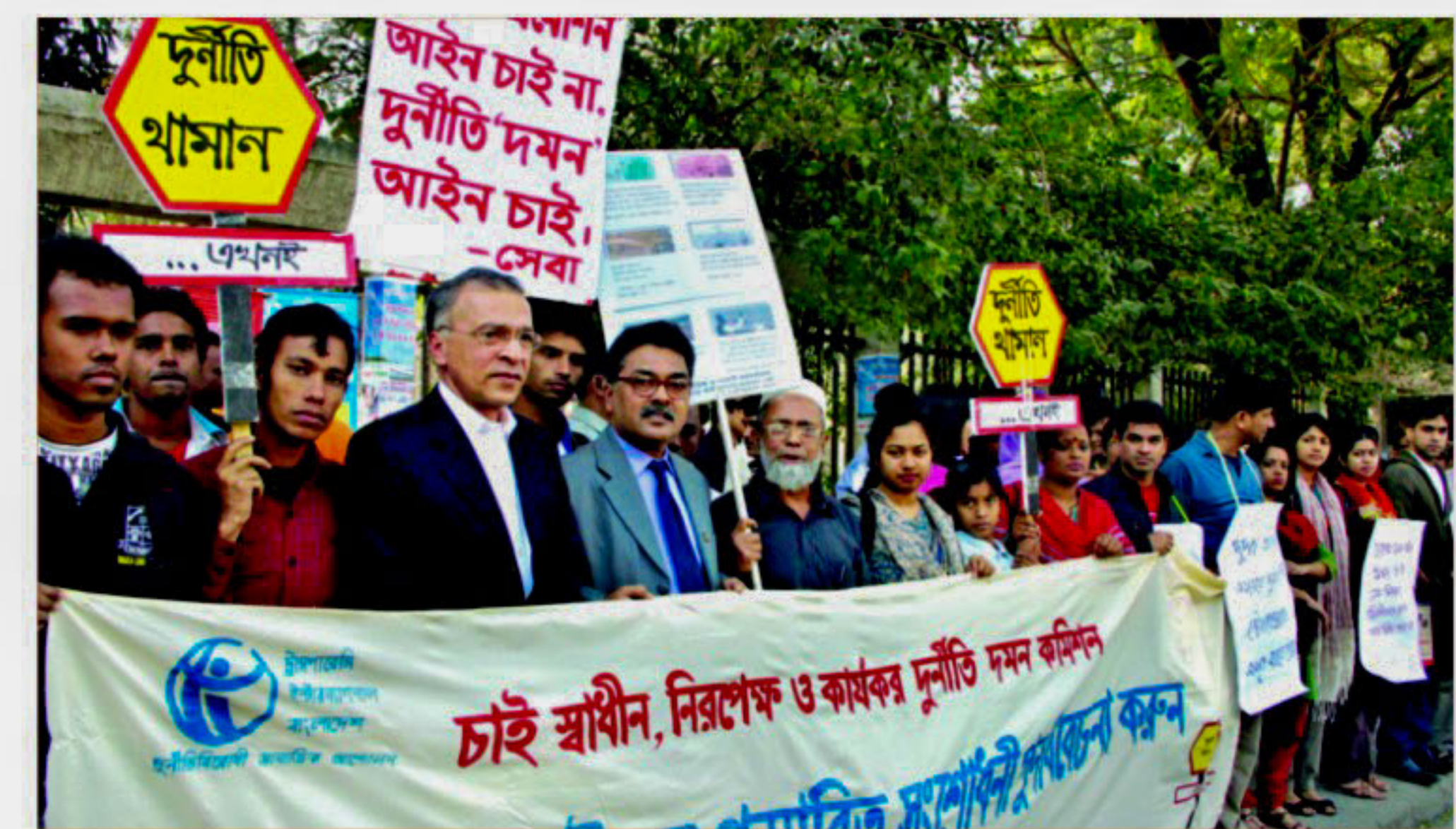
Transparency International Bangladesh forms a human chain in front of the Jatiya Press Club in the city yesterday demanding reconsideration of the proposals approved by the cabinet for amendments to the Anti-Corruption Commission law. (Story on Page 1)