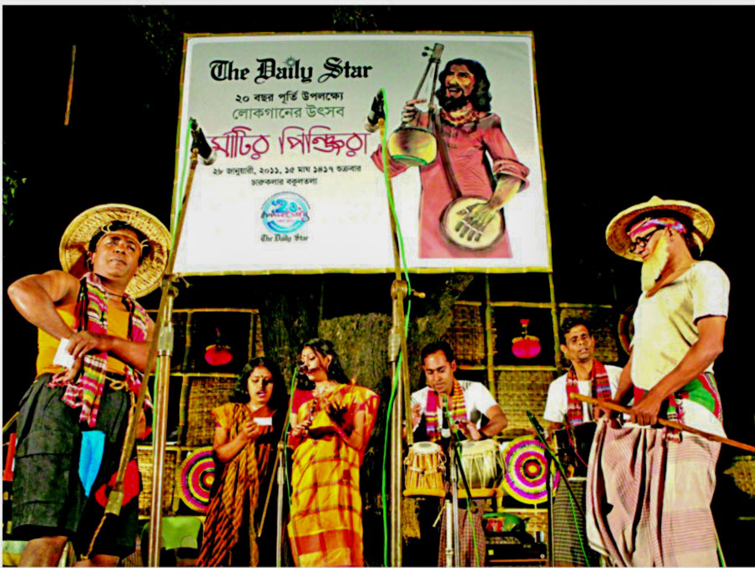
Artistes of Mathal, a Rajshahi-based organisation, perform traditional Gambhira at a programme titled Matir Pinjira marking the 20th anniversary of The Daily Star in the capital yesterday.