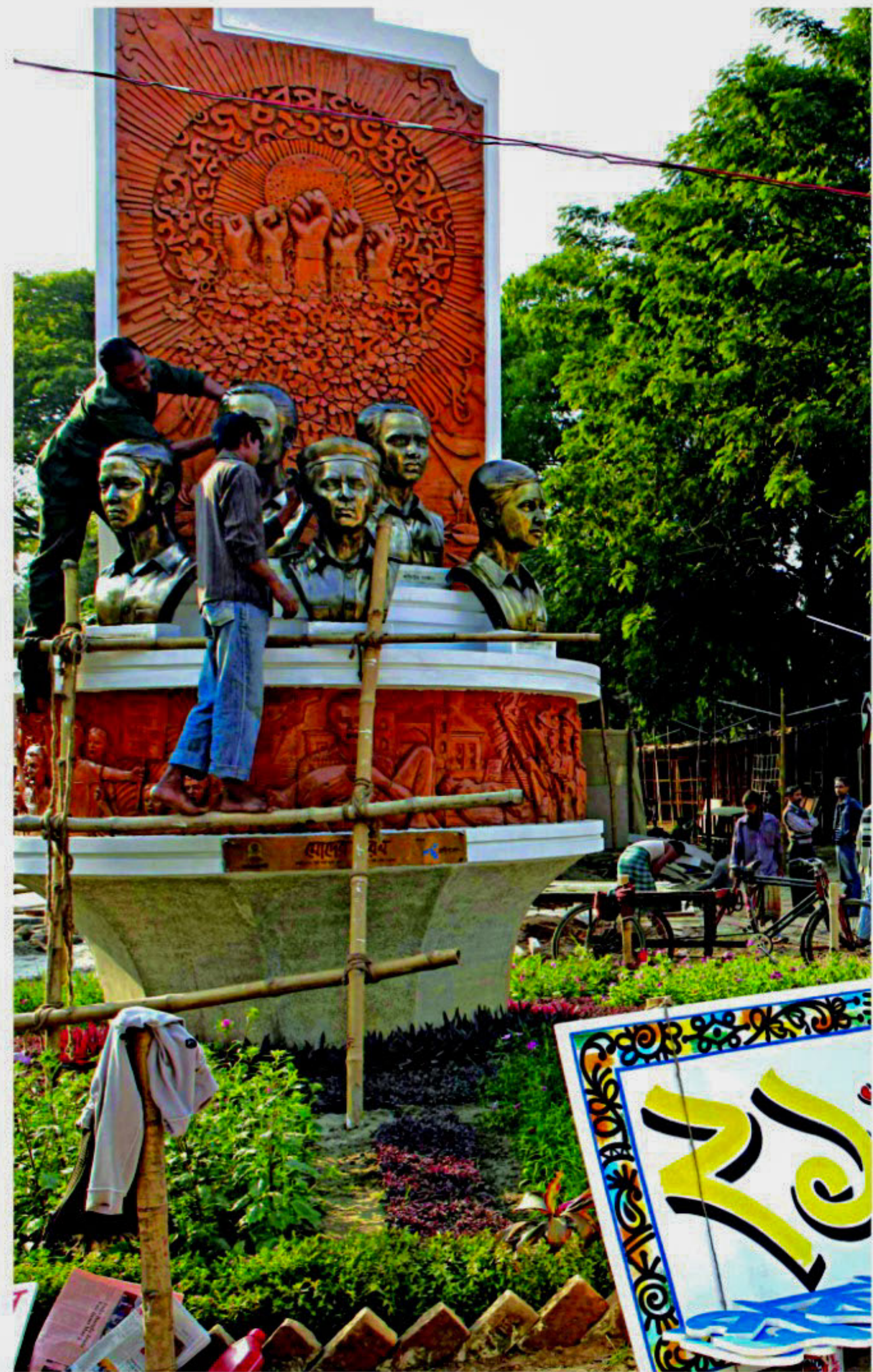
Preparations are underway for the annual Amar Ekushey Bô Mela-2011 on Bangla Academy premises yesterday. The largest book fair of the country will start on February 1.