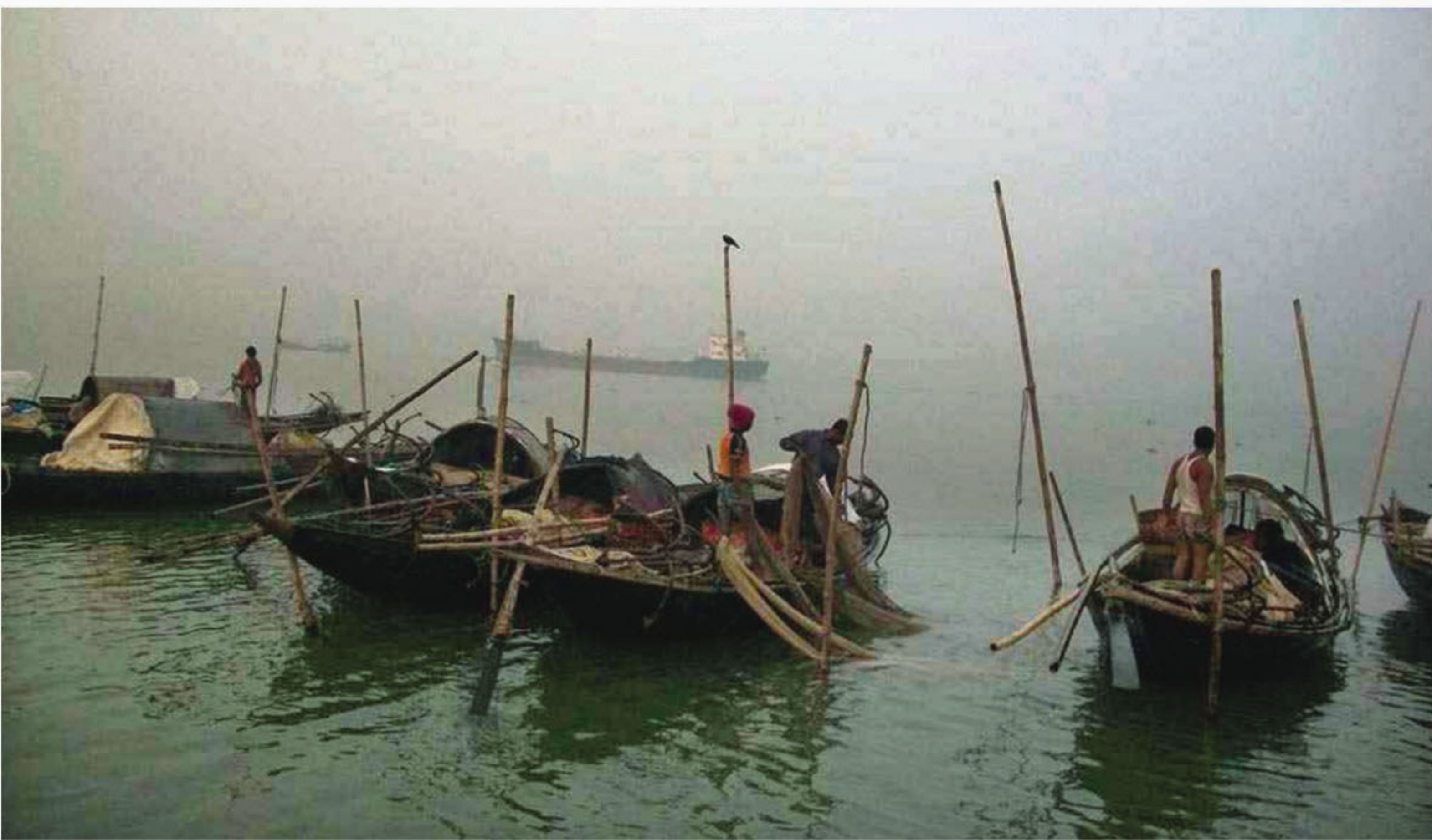
Catching of fry with mosquito nets by a section of unscrupulous fishermen in Meghna River in Chandpur causing depletion of different indigenous species of fish that abound there. The photo was taken yesterday.