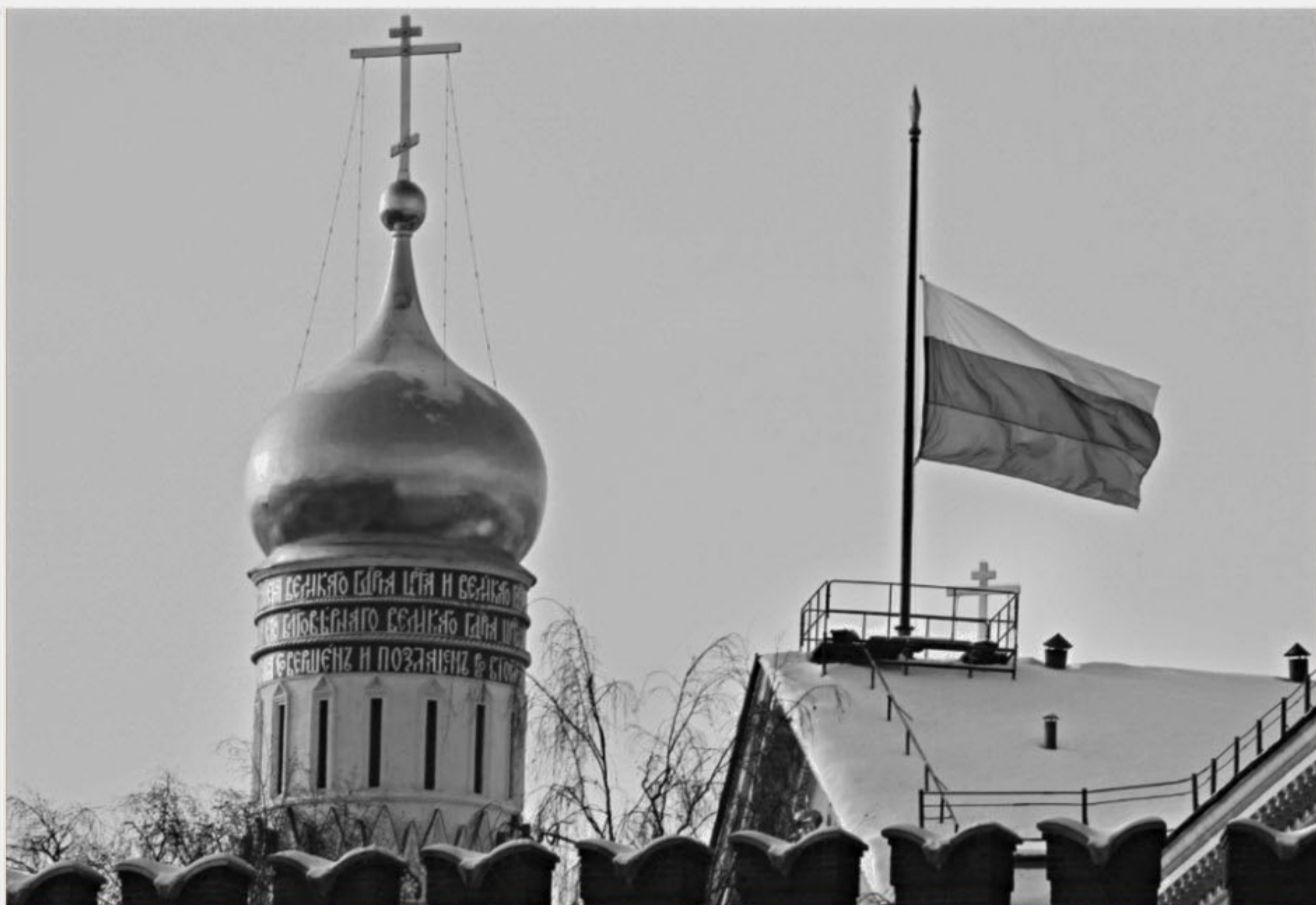
A Russian flag flies at half-mast over the Kremlin in Moscow yesterday, during a day of mourning for the victims of a suicide bombing attack. Moscow held a day of mourning on Wednesday for the 35 people killed in a suicide bombing at Russia's largest airport as 116 people remained hospitalised, officials said.

The explosion was apparently caused by an accumulation of methane gas, Rangel said.