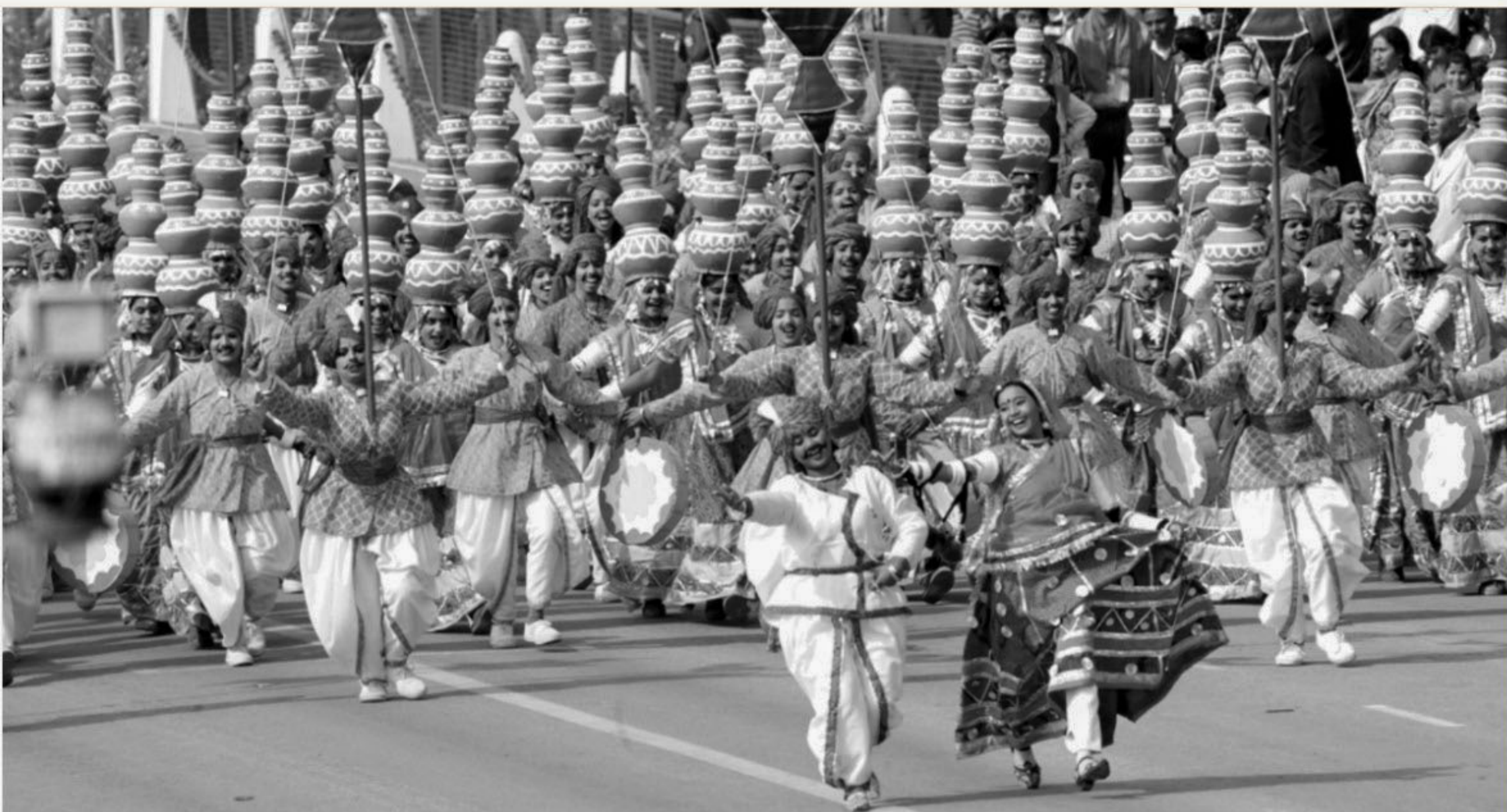
Indian schoolchildren perform during the Republic Day parade in New Delhi yesterday. India celebrated its 62nd Republic Day under heavy security, with tensions running high in Kashmir over efforts by Hindu nationalists to hold a rally in the troubled region's state capital. Security was especially tight in New Delhi where large sections of the capital were sealed off for the annual parade of military hardware.