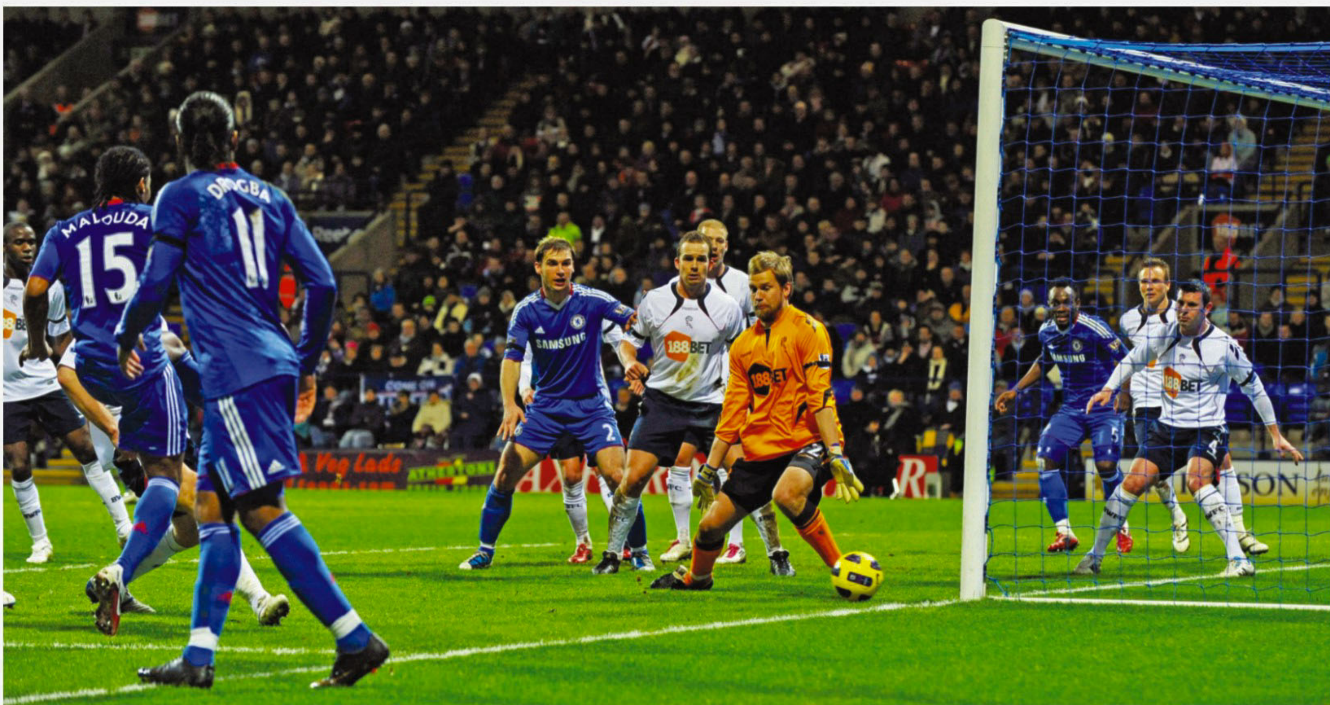
Chelsea winger Florent Malouda (L) scores the second goal against Bolton Wanderers during their Premier League encounter at the Reebok Stadium on Monday.