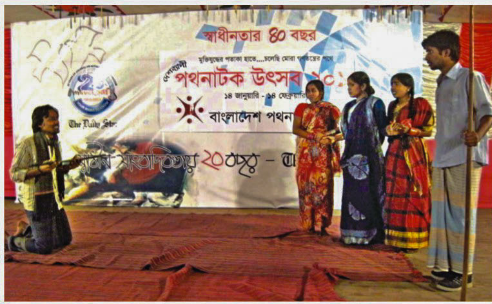
Scenes from the plays.