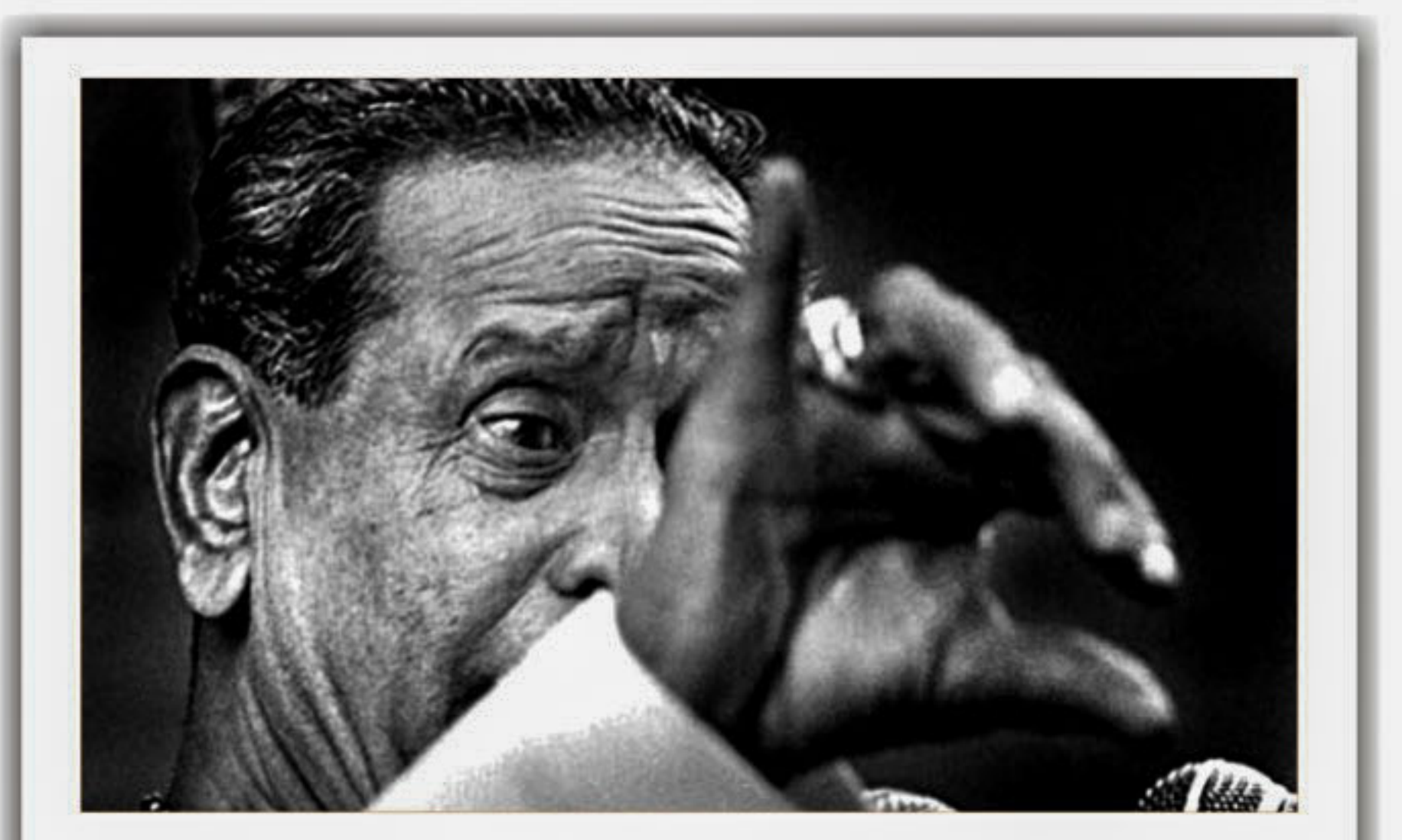
Pandit Bhimsen Joshi