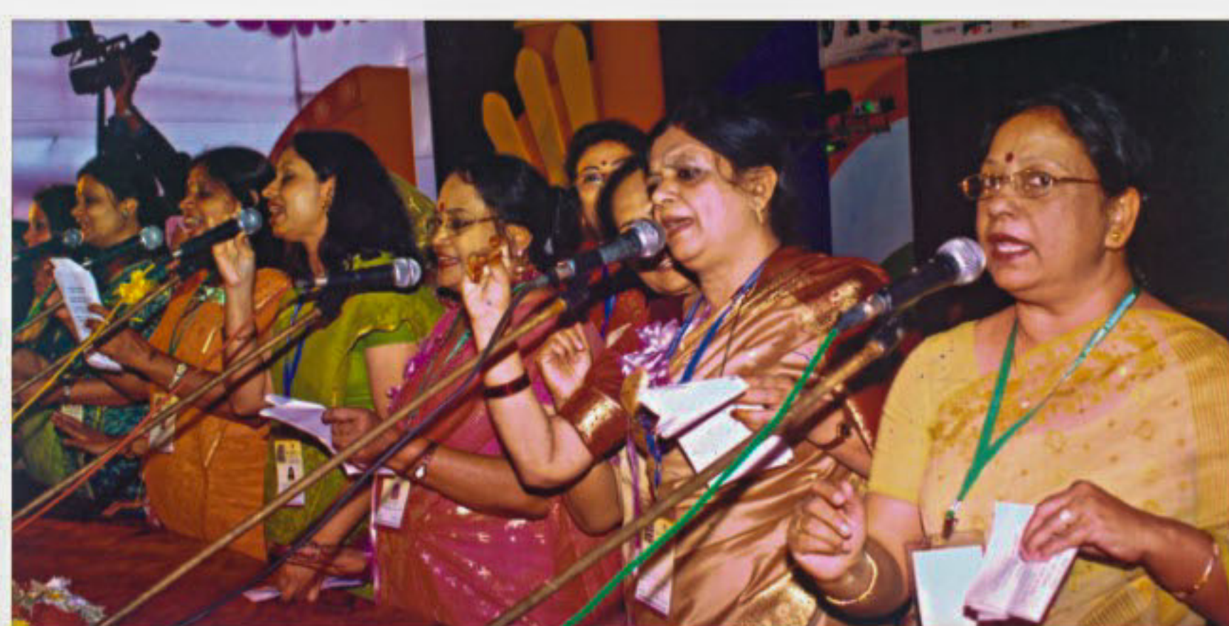
Singing of those who were...