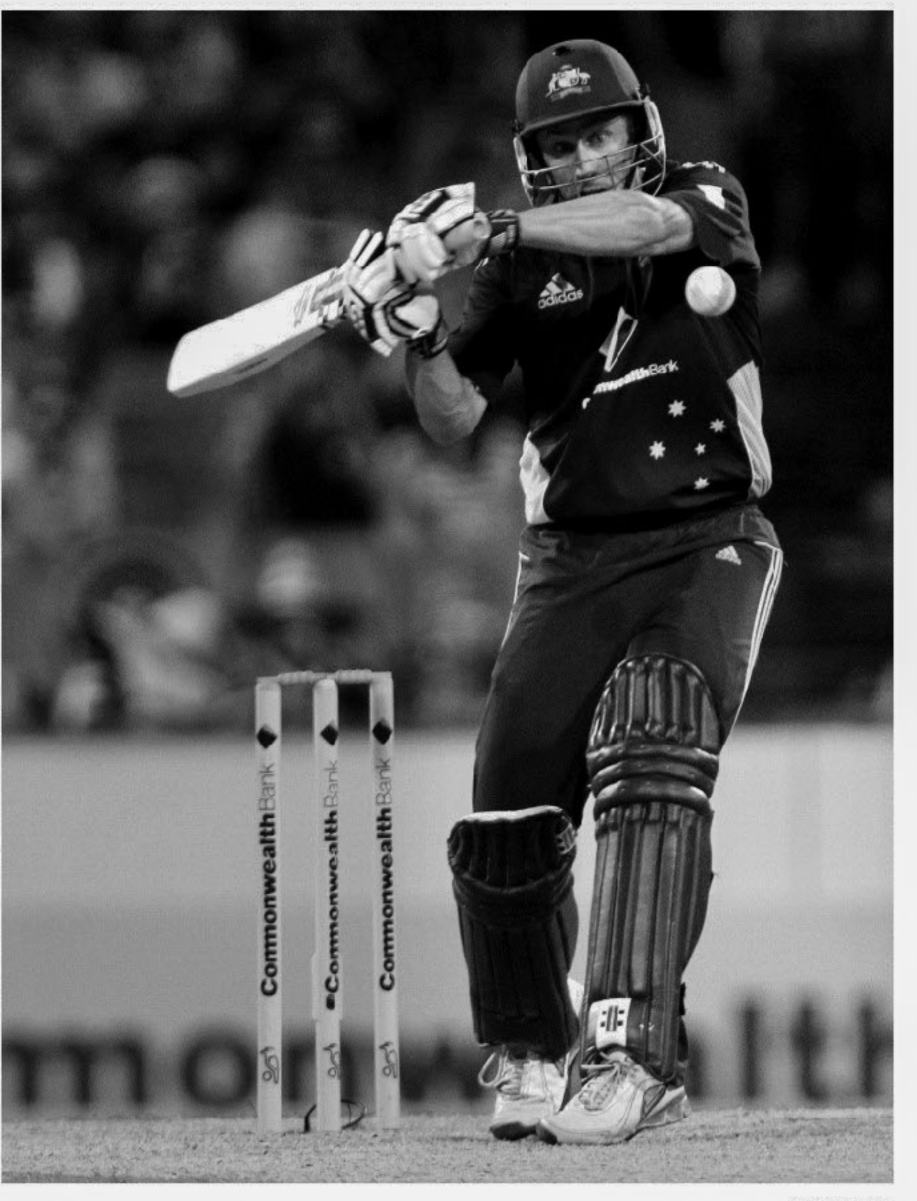
Australia batsman David Hussey lines up a pull shot during the third ODI against England at the Sydney Cricket Ground yesterday.