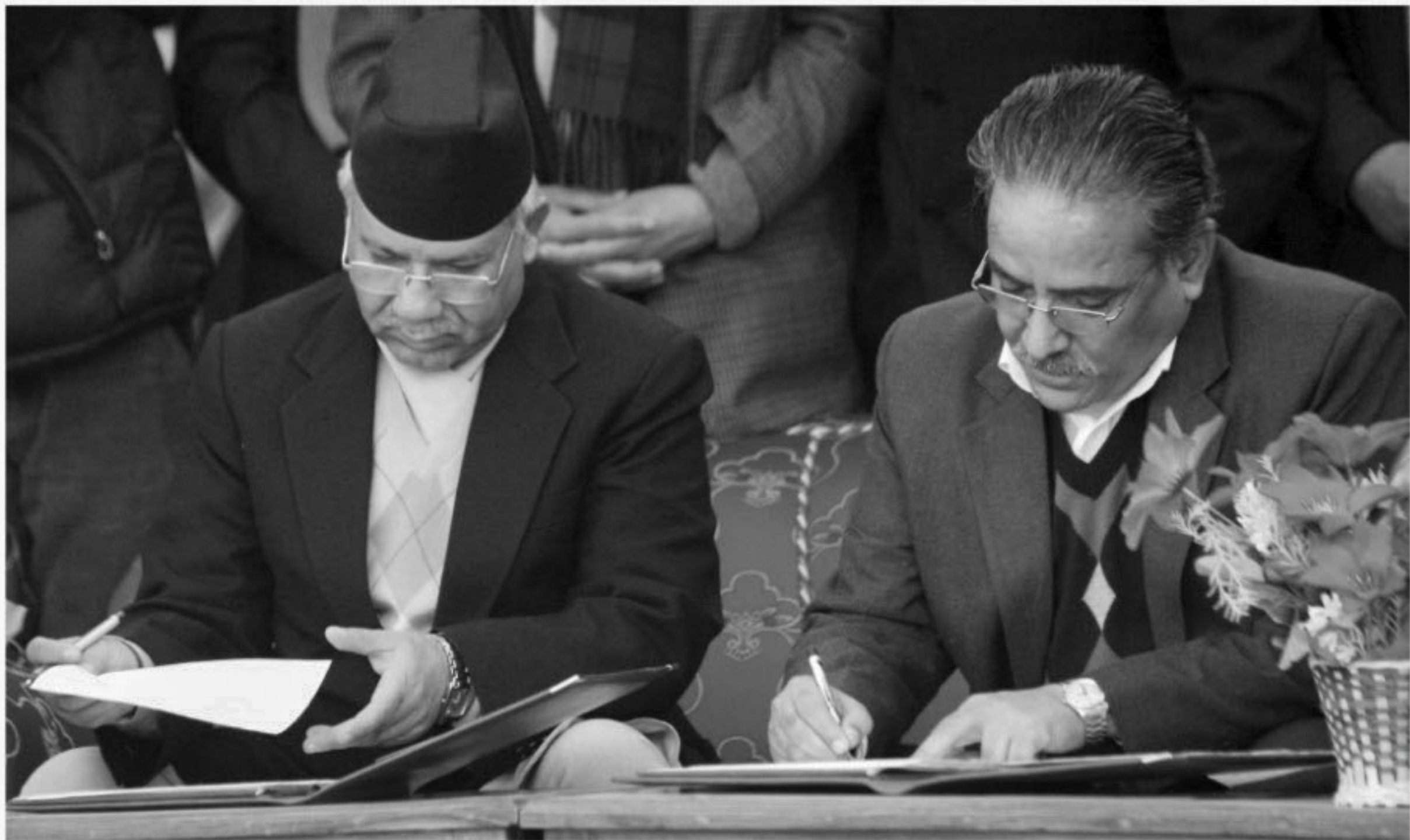
Nepalese caretaker Prime Minister Madhav Kumar Nepal (L) and Unified Communist Party of Nepal Chairman Pushpa Kamal Dahal, also known as "Prachanda", sign documents during a special function at the Shaktikhor cantonment site, Chitwan some 170km south of Kathmandu yesterday. Nepal's Maoists formally relinquished control of their People's Liberation Army, more than four years after ending a bloody insurgency. The leader of the former guerrillas, now the main opposition party, handed control of 19,000 soldiers confined to cantonments around Nepal since the war ended in 2006 to a cross-party committee set up to decide their fate.

"Till then, they can't carry on mining", he said.