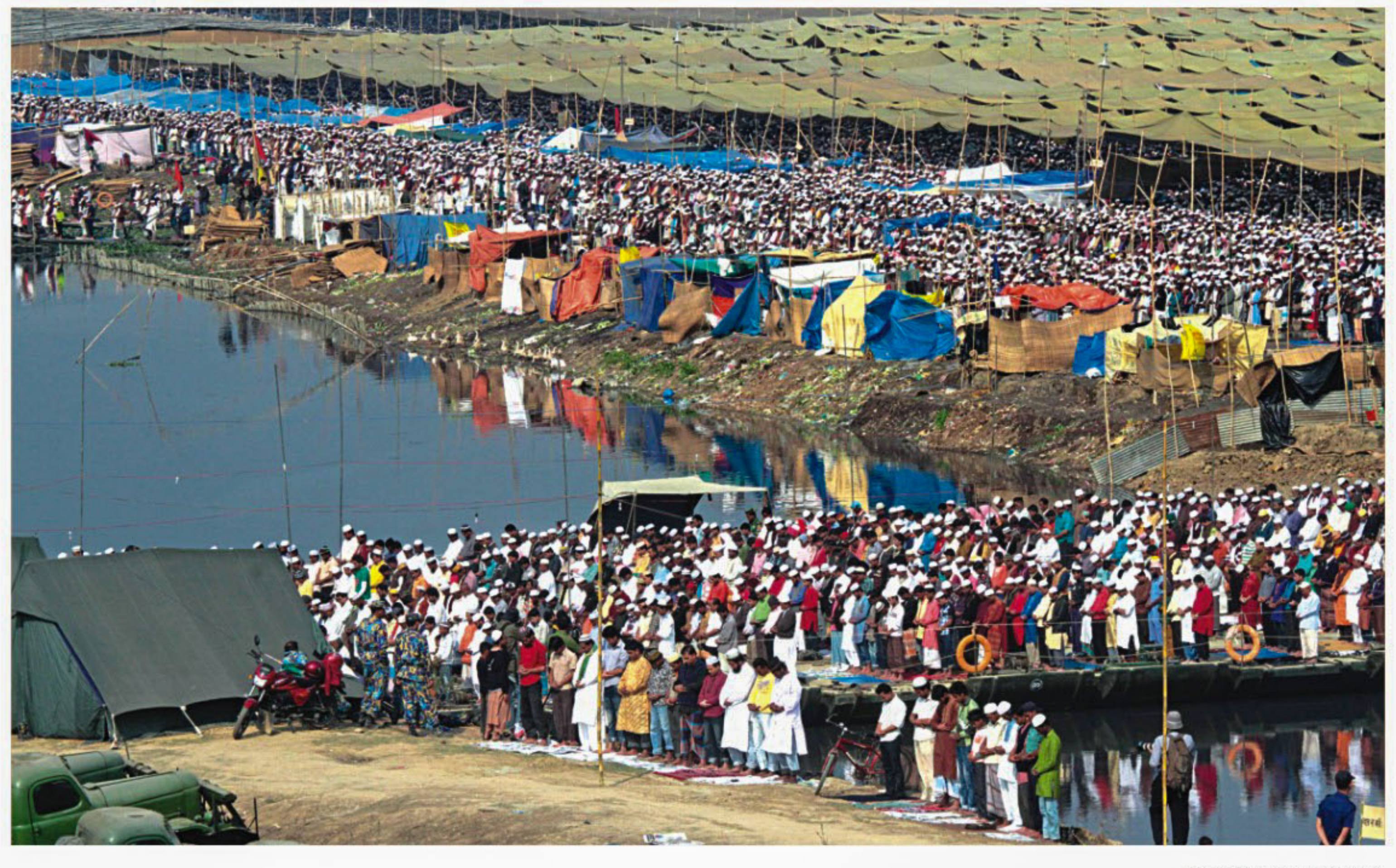
Devotees stand for Juma prayers at the Biswa Ijtema ground on the bank of Turag yesterday.

Devotees from 33 districts including Gazipur, Narsingdi, Mymensingh, Kishoreganj, Sherpur, Faridpur, Rajbari, Shariatpur, Chittagong, Khagrachari, Rangamati, Bandarban, Chandpur, Sylhet, Habiganj, Rajshahi, Natore, Sirajganj, Dinajpur, Rangpur, Khulna, Bagerhat, Jessore, Narail, and Kushtia are attending in the first phase.