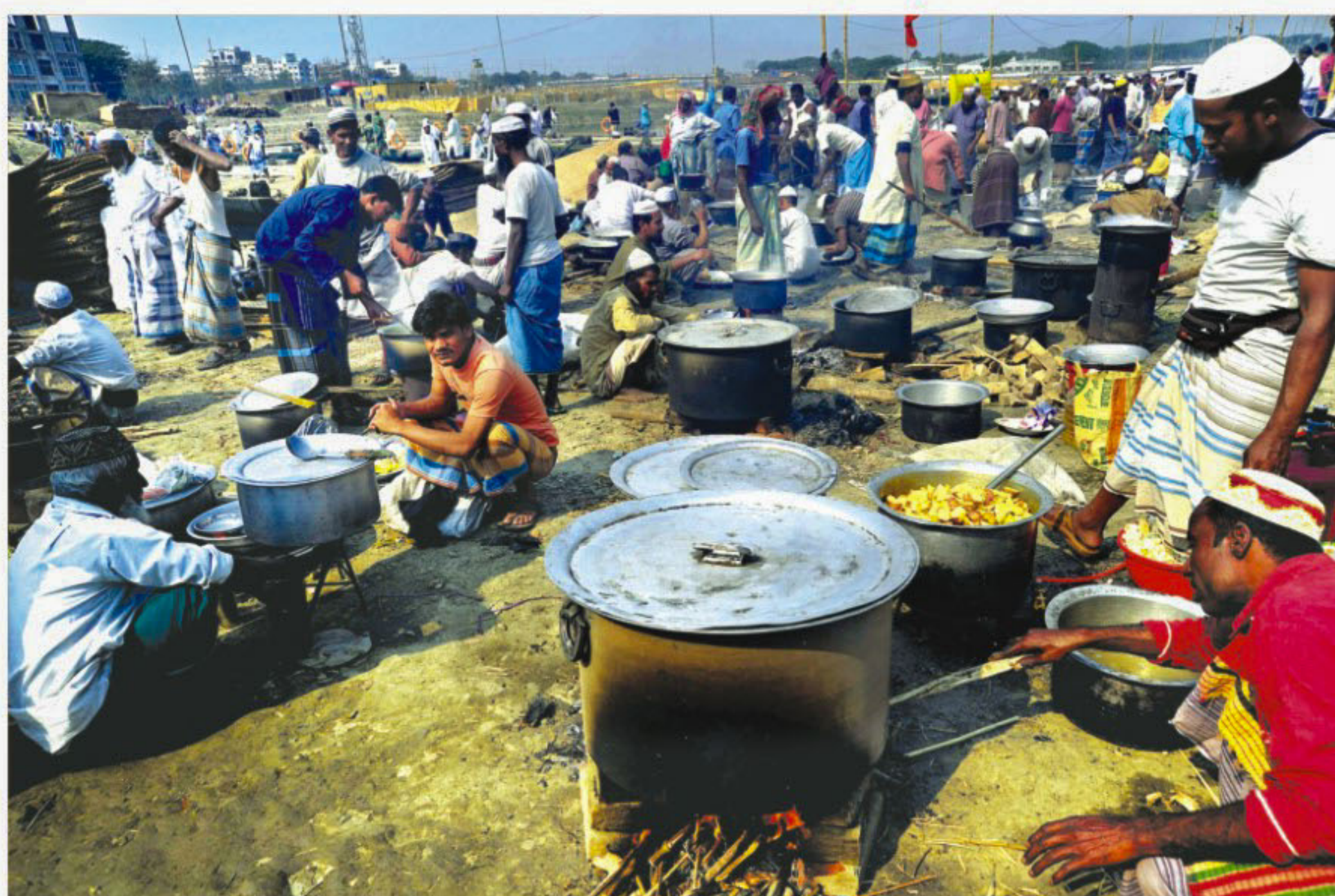
Some devotees are busy cooking lunch on the field of Biswa Ijtema, a large congregation of world's Muslims. The Ijtema begins today on the bank of Turag River in Tongi.

Representatives from different organisations and countries including Afghanistan, India, Sri Lanka, the Maldives, and Pakistan took part in the news conference.