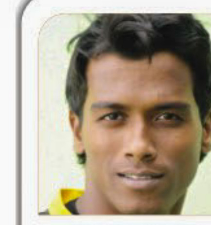
RUBEL HOSSAIN Born 01-01-1990 Playing Role Right-arm