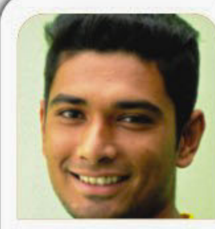
MAHMUDULLAH Born 04-02-1986, Mymensingh Playing Role Right-handed