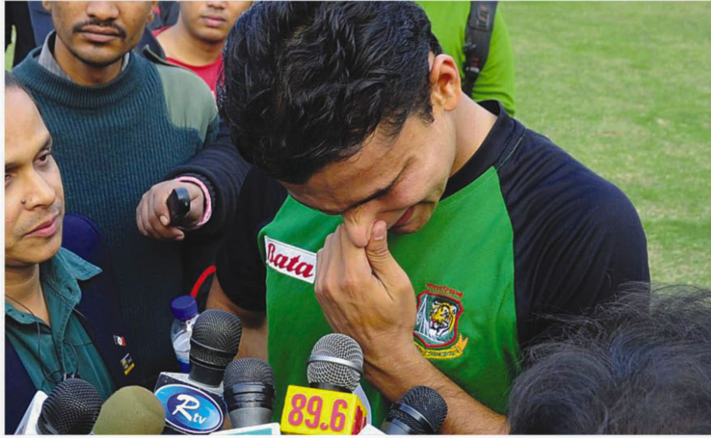
BROKEN EXPRESS: Bangladesh paceman Mashrafe Bin Mortaza breaks down in tears at news of his non-selection for the World Cup at the Sher-e-Bangla National Stadium yesterday.