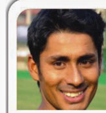
MOHAMMAD ASHRAFUL Born 07-07-1984, Dhaka Playing Role Right-handed