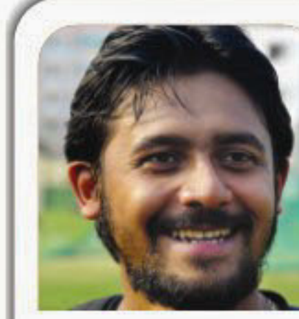
SHAHRIAR NAFEES Born 25-01-1986, Dhaka Playing Role Left-handed batsman