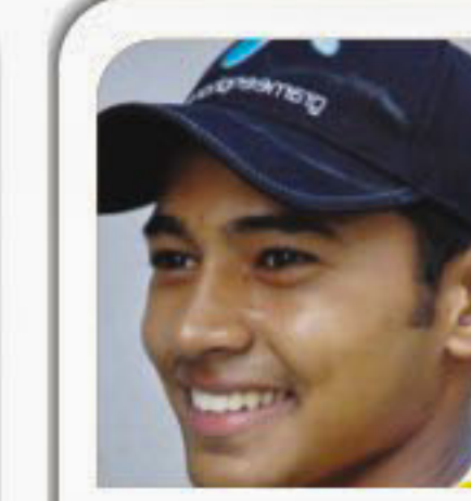
MUSHFIQUR RAHIM Born 01-09-1988, Bogra Playing Role Wicketkeeper