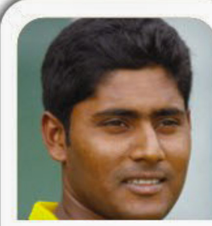
IMRUL KAYES Born 02-02-1987, Meherpur Playing Role Left-handed batsman