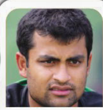
TAMIM IQBAL Born 20-03-1989, Chittagong Playing Role Left-handed batsman