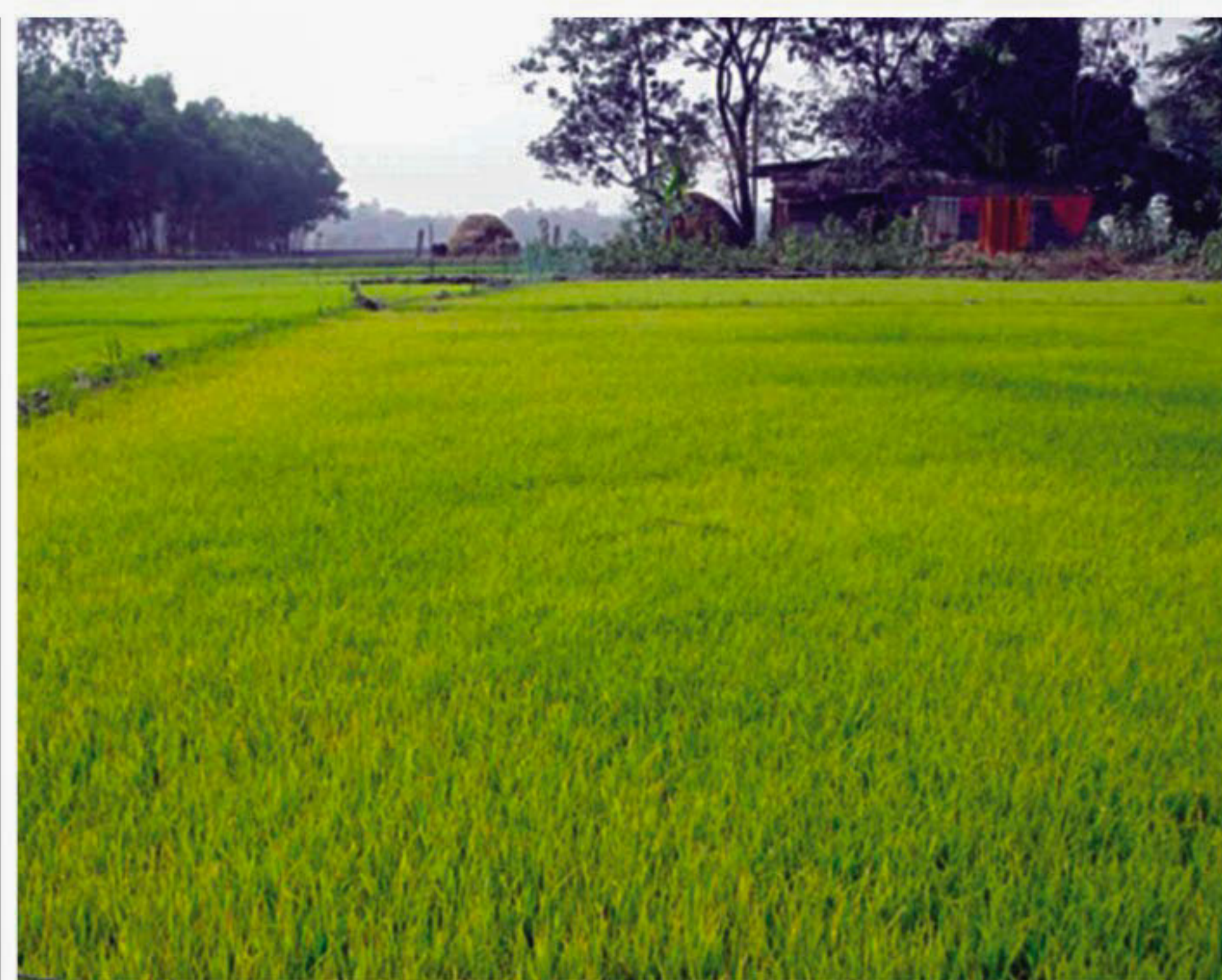
A boro seedbed in Dinajpur Sadar upazila gets yellowish as prolonged cold and foggy weather is causing damage to the saplings.