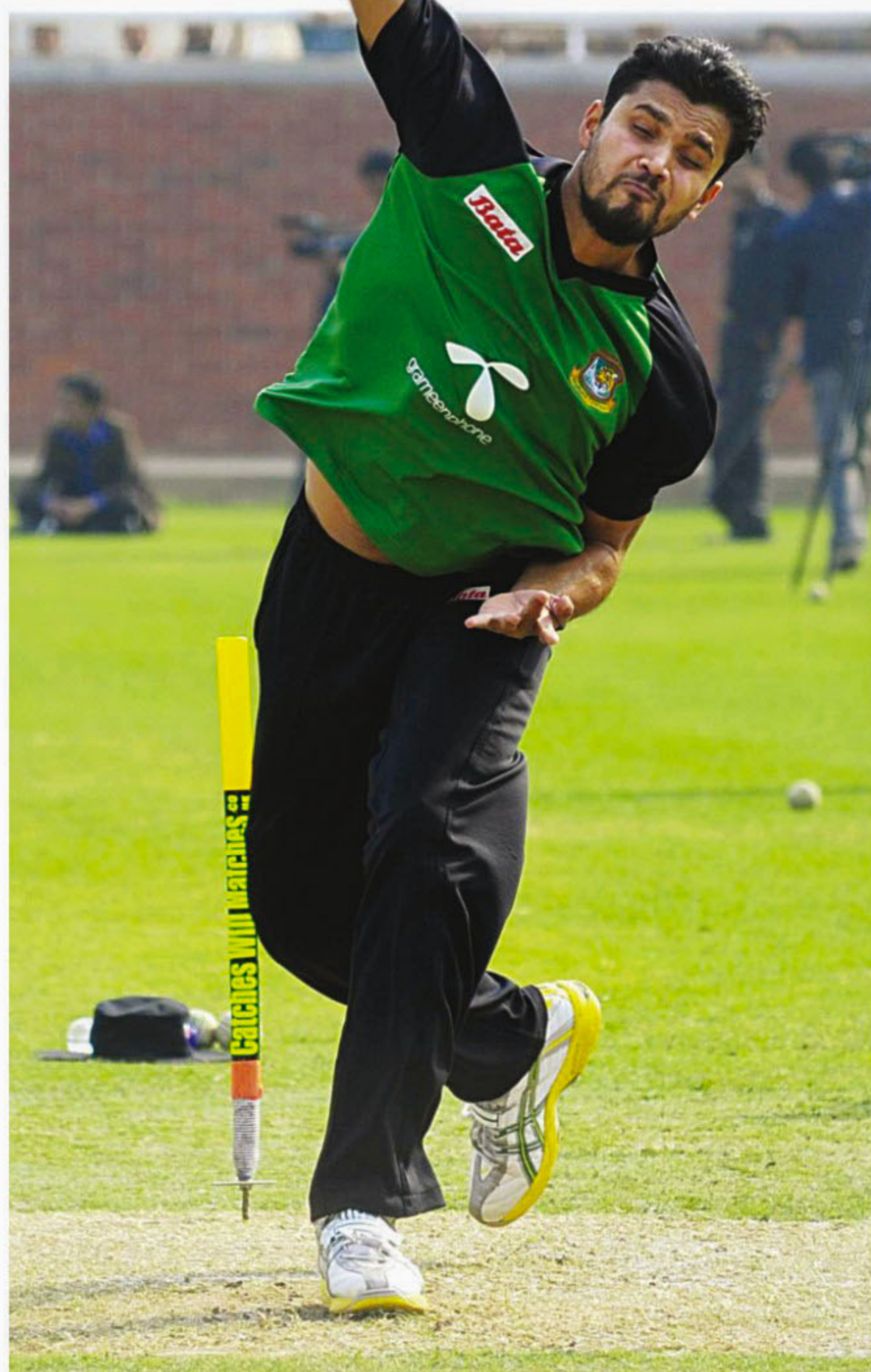
READY OR NOT? Bangladesh pacer Mashrafe Bin Mortaza is seen bowling at the Academy Ground yesterday off a two-step run up in his bid to be fit for the 2011 World Cup.

Sponsor Prime Bank will provide Tk 1.5 lakh out of estimated budget of Tk 3.75 lakh.