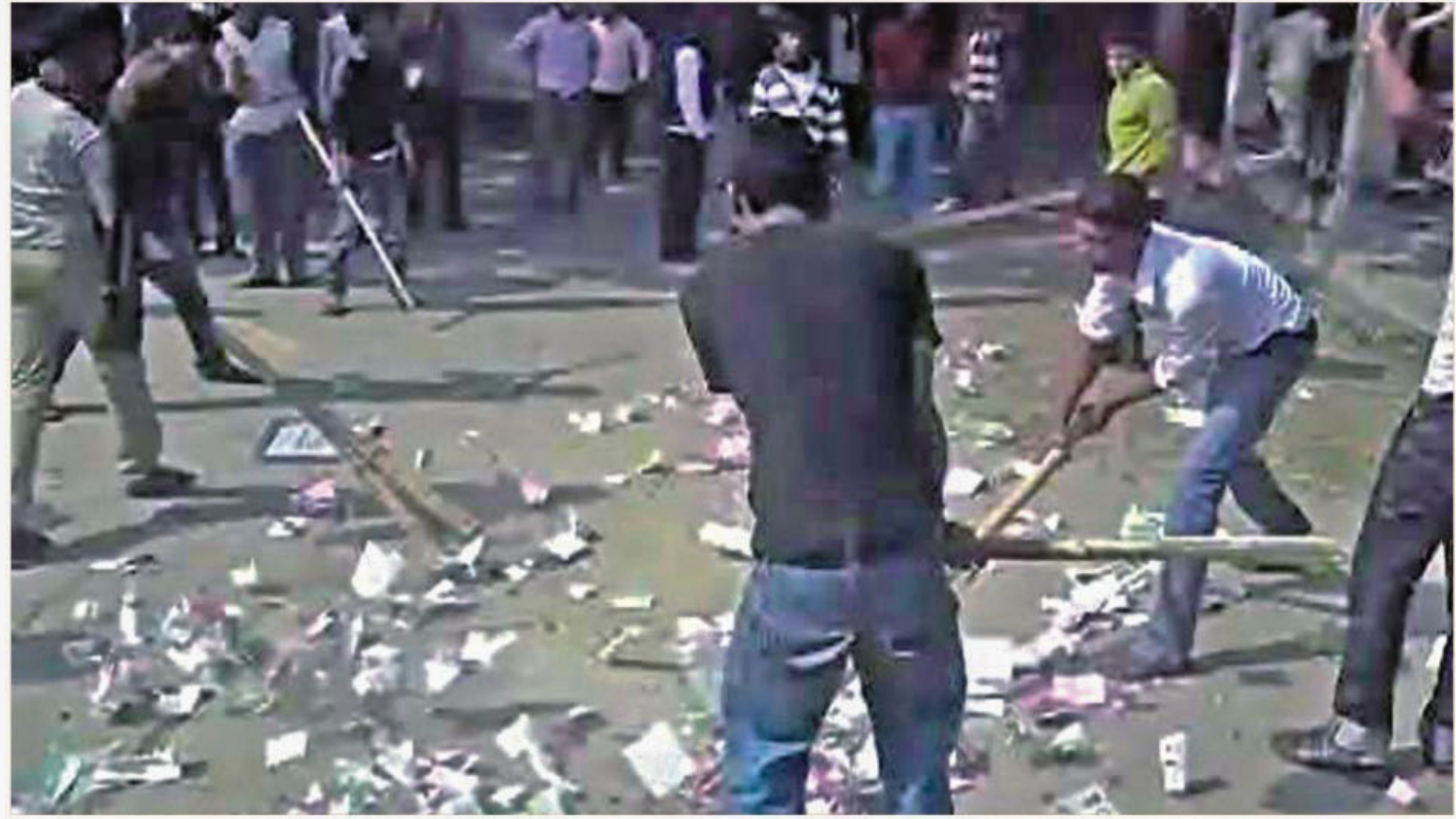
A group of youths, reportedly all Awami League supporters, destroy ballot papers after snatching from Noakhali Primary School polling station during the municipal elections yesterday.