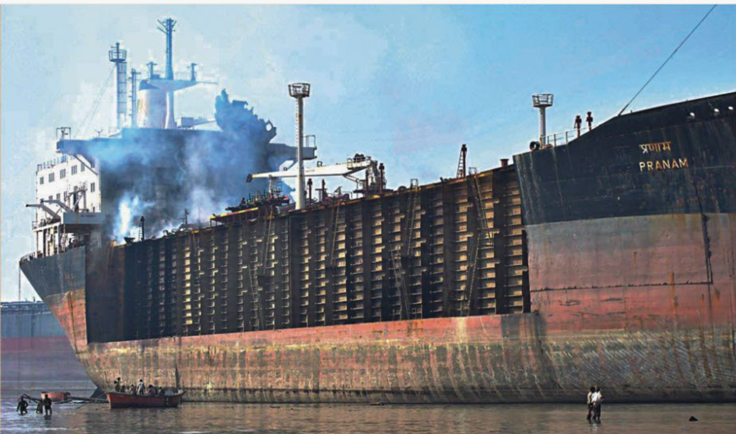
A plume of smoke billows from a vessel at a ship-breaking yard of Sitakunda in Chittagong following an explosion that killed four workers yesterday.