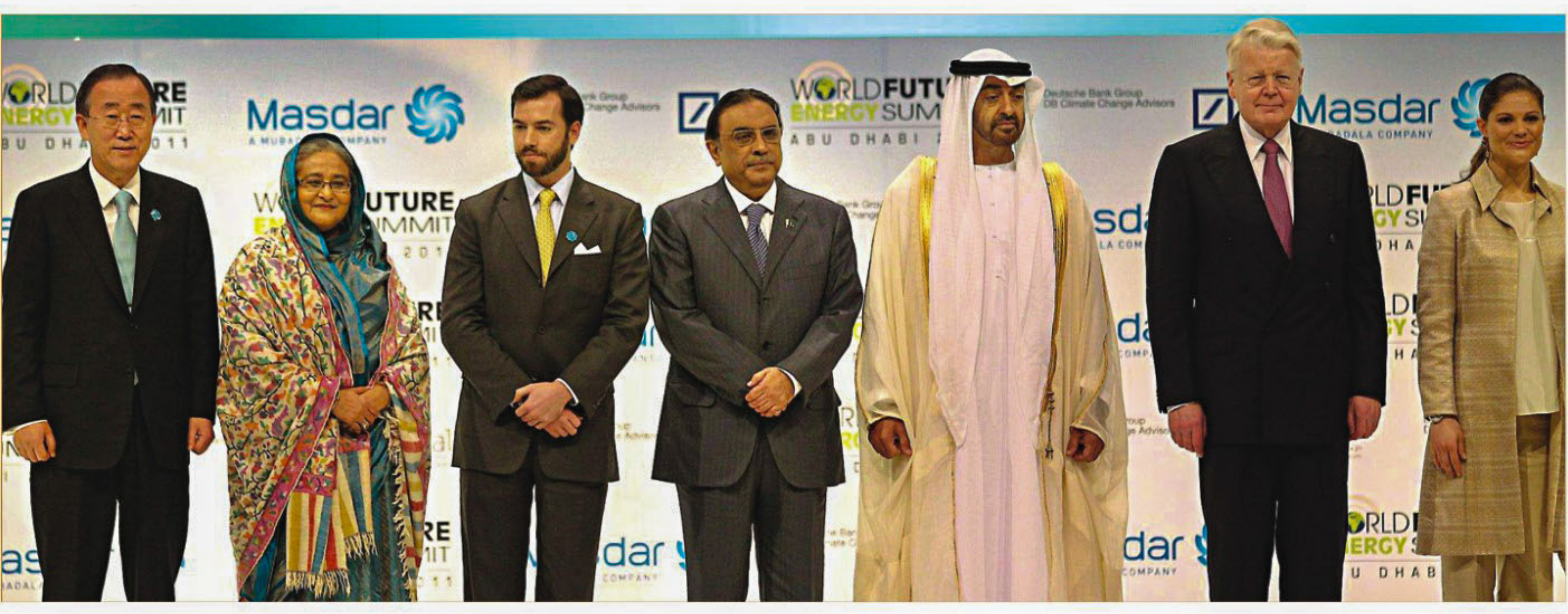
Left to right, UN Secretary General Ban Ki-moon, Prime Minister Sheikh Hasina, Luxembourg's Crown Prince Guillaume, Pakistan President Asif Ali Zardari, Crown Prince of Abu Dhabi Sheikh Mohammed bin Zayed al-Nahyan, Iceland President Ólafur Ragnar Grímsson and Sweden's Crown Princess Victoria pose for photographs at the annual World Future Energy summit in Abu Dhabi yesterday. (Story on page 1)