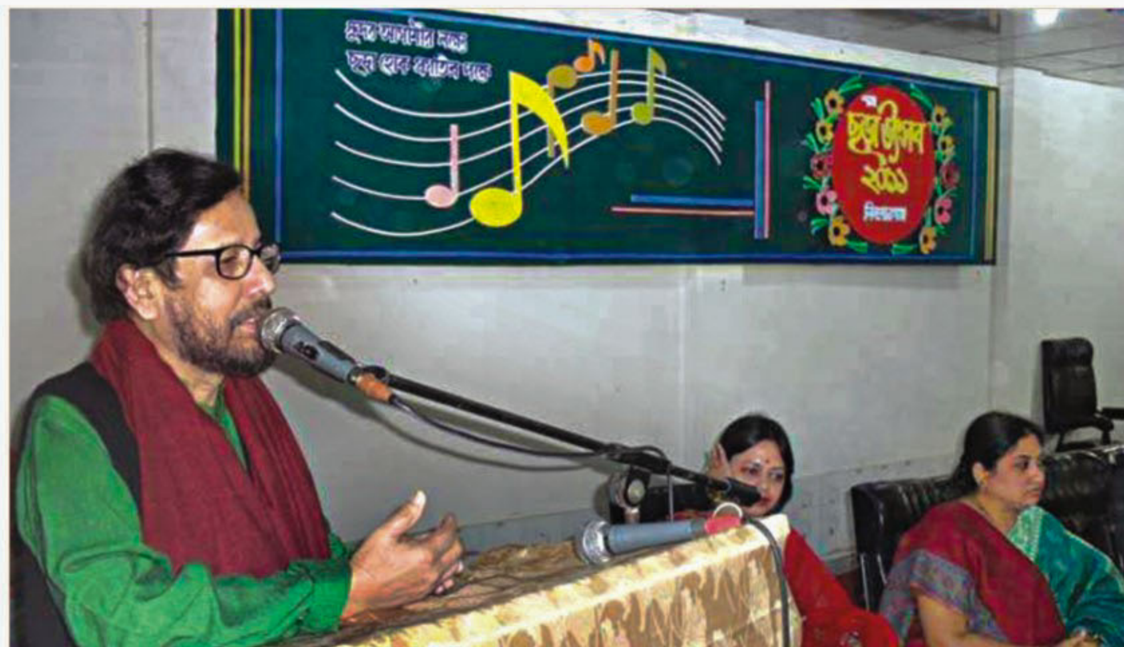
Lawmaker Asaduzzaman Noor speaks at the Chhorha Utshab