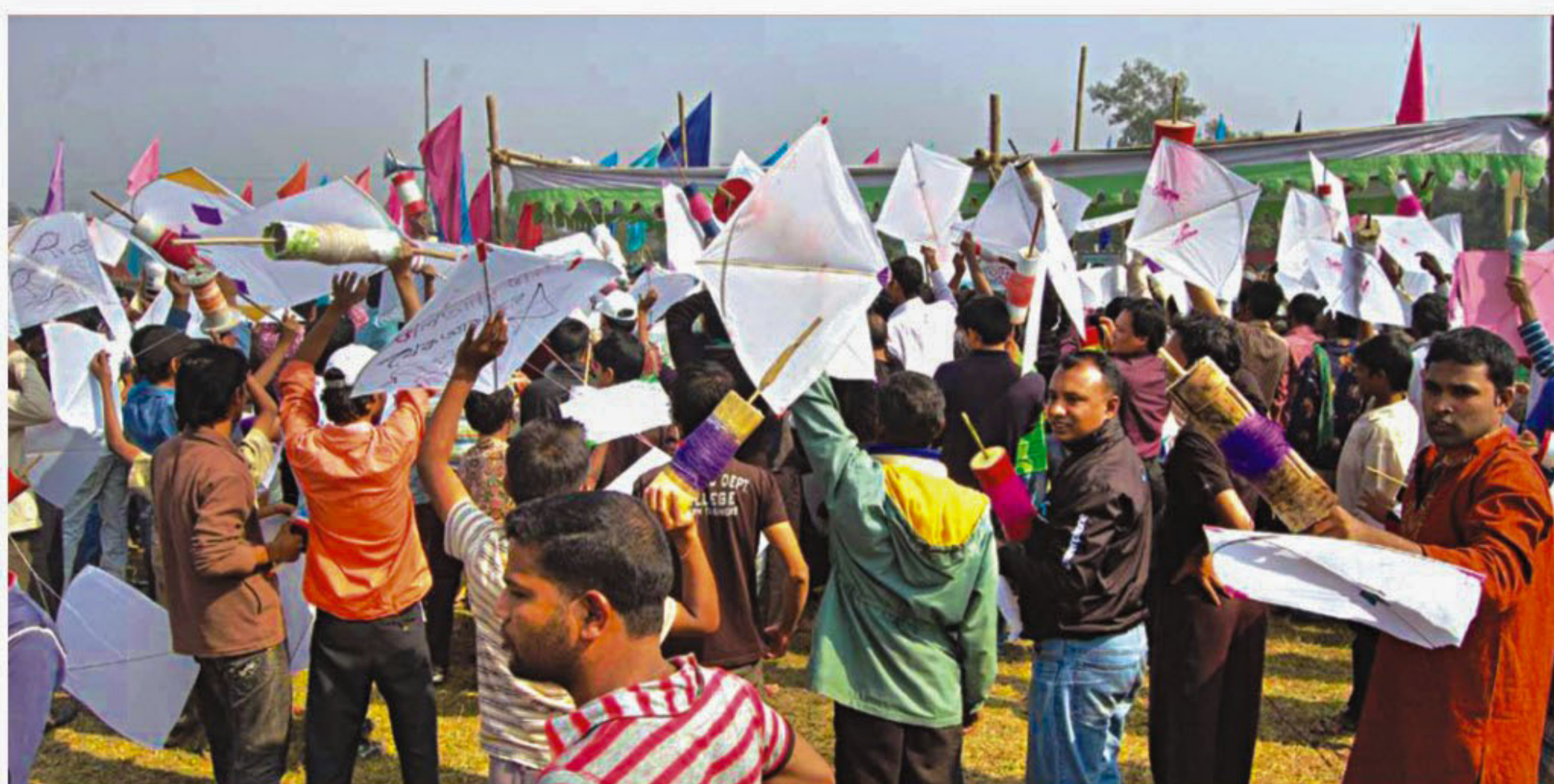
The festival drew minors as well as septuagenarians who had turned out in droves to witness the event.

The festival drew minors as well as septuagenarians who had turned out in droves to witness the event.