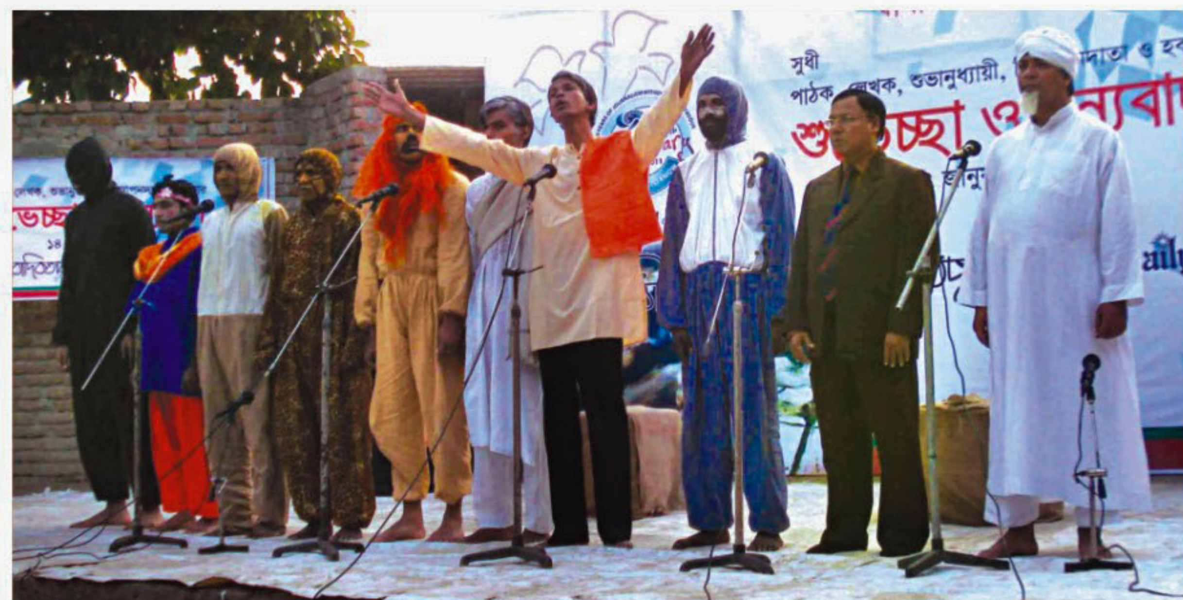
Bangladesh Patha Natok Parishad organised the festival in association with The Daily Star.