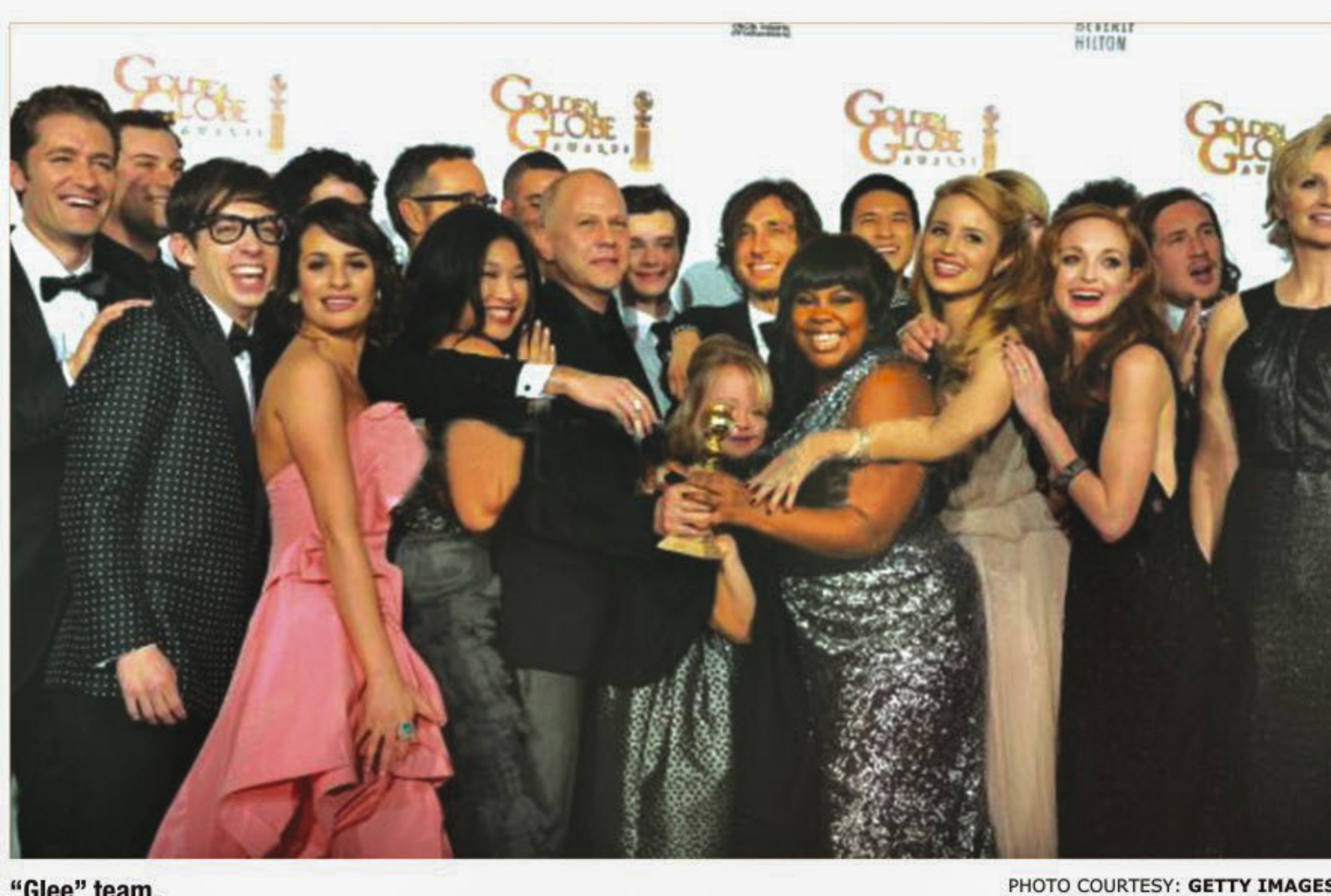
"Glee" team.