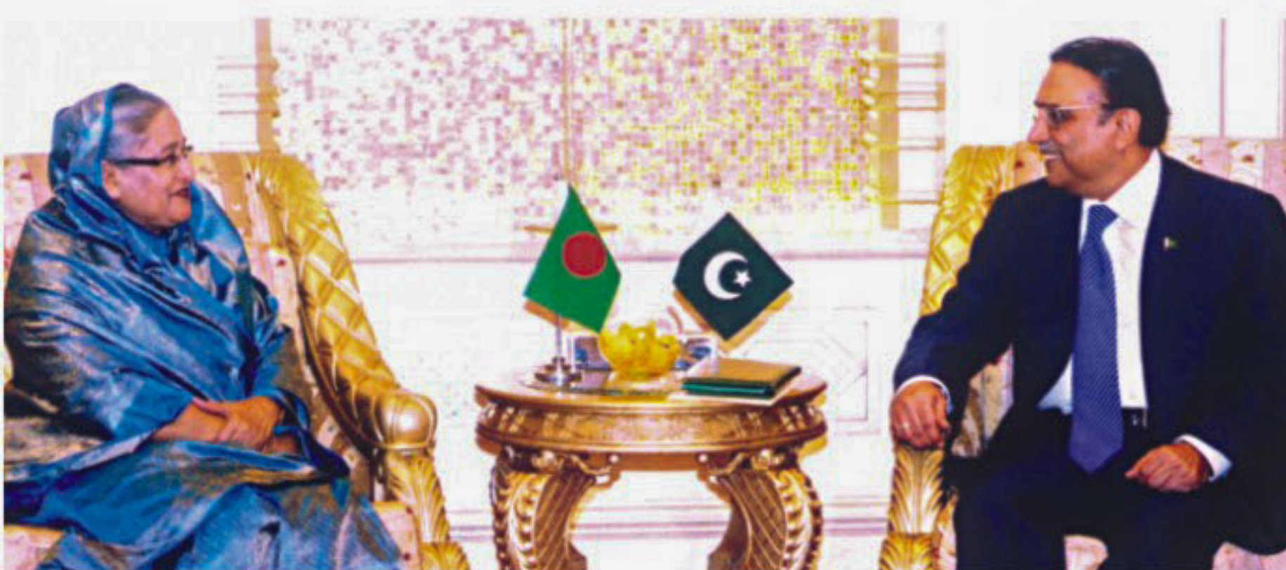
Prime Minister Sheikh Hasina holds talks with Pakistani President Asif Ali Zardari at The Emirates Palace in Abu Dhabi yesterday. (Story on Page 1)