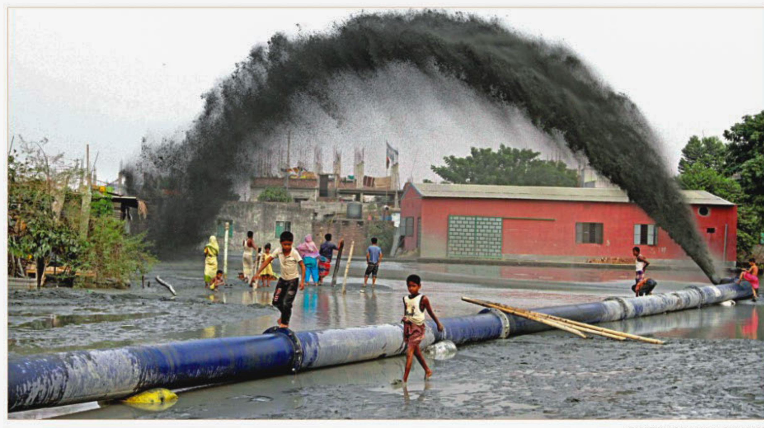
This recent photo shows a pond at Kamrangirchar is being filled up by a madrasa authority with silts from the Buriganga River. An HC directive came yesterday against earth filling and illegal housing in and around Dhaka.

STAR REPORT Ruling Awami League-backed candidates took the lead in yesterday's municipality polls in Dhaka division, by winning seven more mayoral posts than their BNP-picked archrivals. Elections were held to all 63 municipalities of the division. But the result of Kaliakoir municipality in Gazipur was not decided as voting to eight polling stations there was suspended. AL-backed candidates bagged 27 out of 63 mayoral posts while BNP's favourites got 20. Rebels affiliated with SEE PAGE 19 COL 1 SEE CHART OF MAYORS-ELECT ON PAGE 19