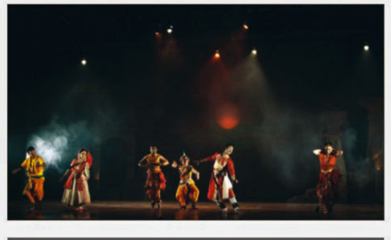
The highlight of the event was "Chaturongo", a grand arrangement that brought together around 100 dancers on the stage.