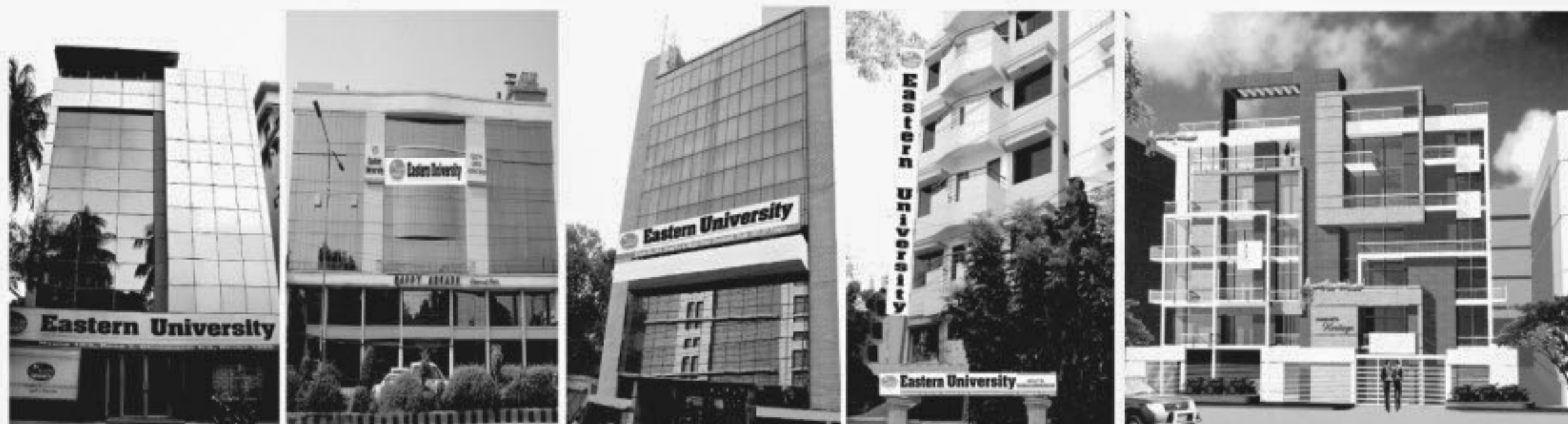
Administration & Library