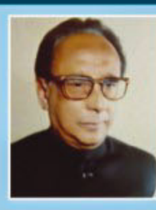
Mr Md. Zillur Rahman Honorable Chancellor President, People's Republic of Bangladesh