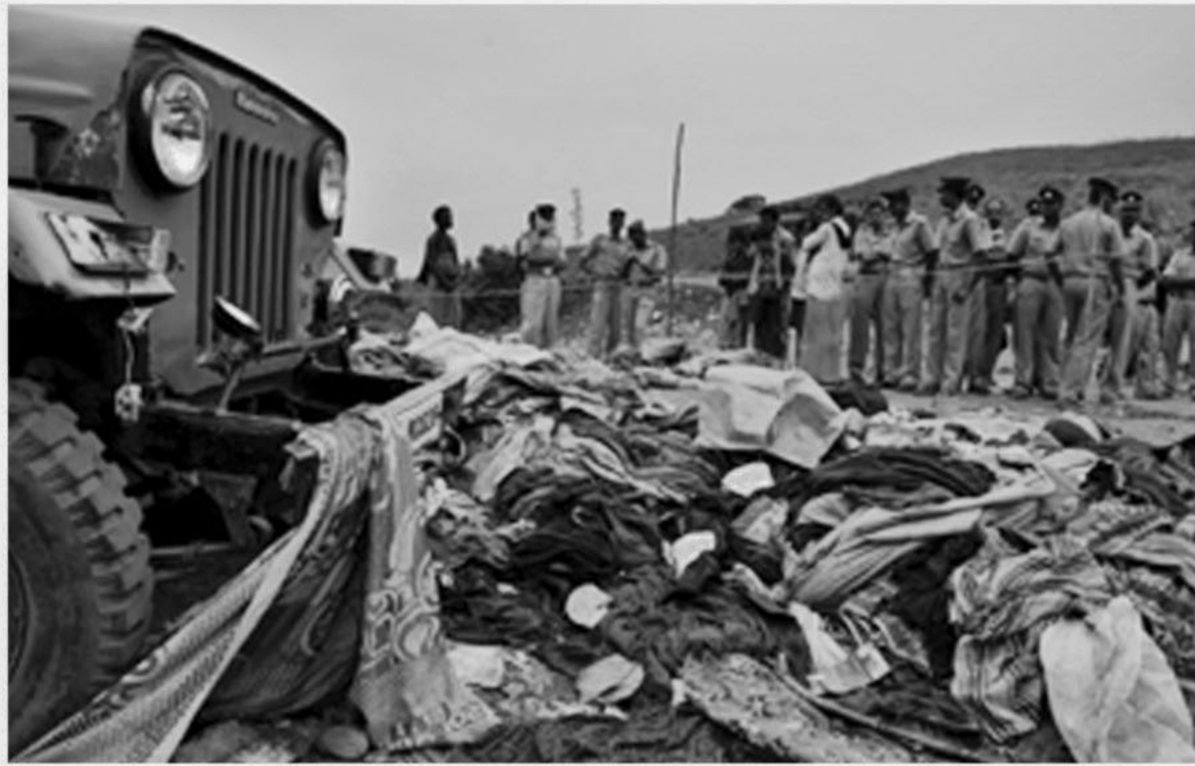
Clothing and belongings of victims are seen as Indian police officials stand near the accident spot which caused a stampede at Pullumedu, some 210 km northeast of the southern Indian city of Kochi yesterday. More than 100 Hindu devotees were killed after a road accident triggered a stampede among thousands of pilgrims returning from an Indian religious festival at the hill shrine of Sabarimala.

"The situation at present is not conducive for withdrawal of troops," he added.