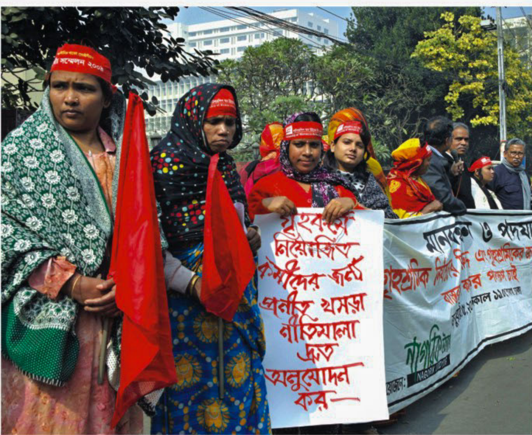
Nagorik Uddyog and Partnership of Women in Action form a human chain in front of the city's National Museum yesterday demanding formulation of an effective policy to stop all forms of violence against domestic workers. (Story on Page 2)