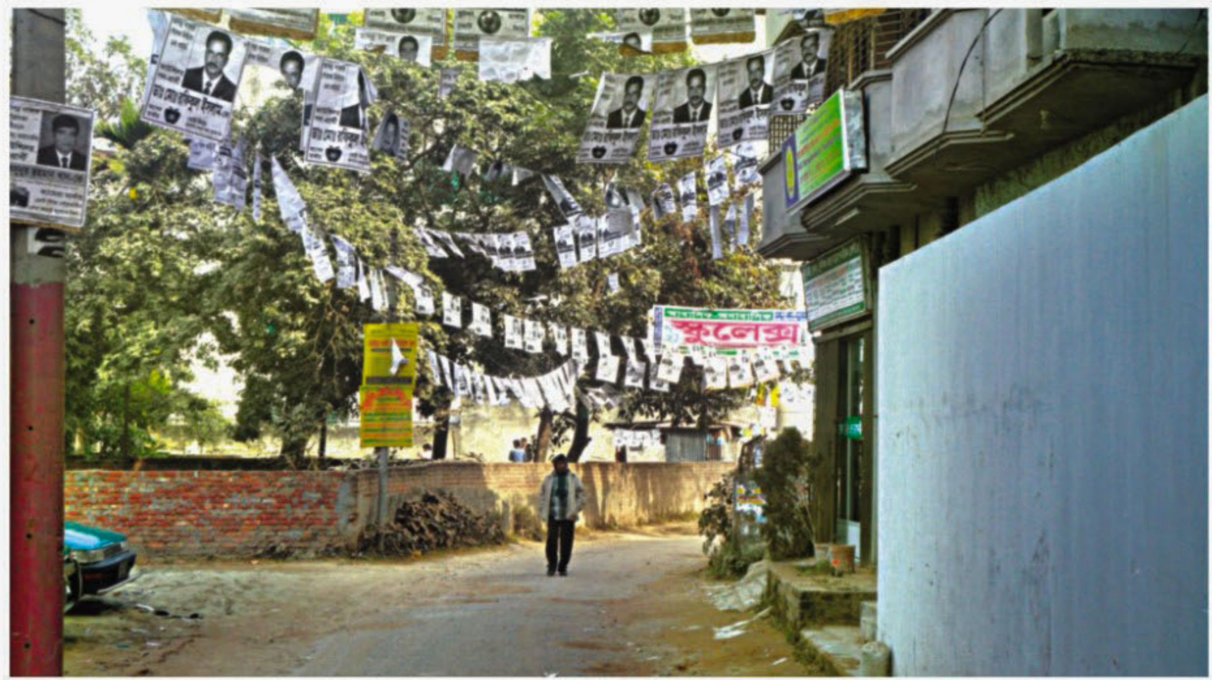
As the country is in mood for municipal polls, posters are hung overhead but a wall is left untouched at Savar yesterday. The polls code prohibits campaigners from pasting posters on walls.