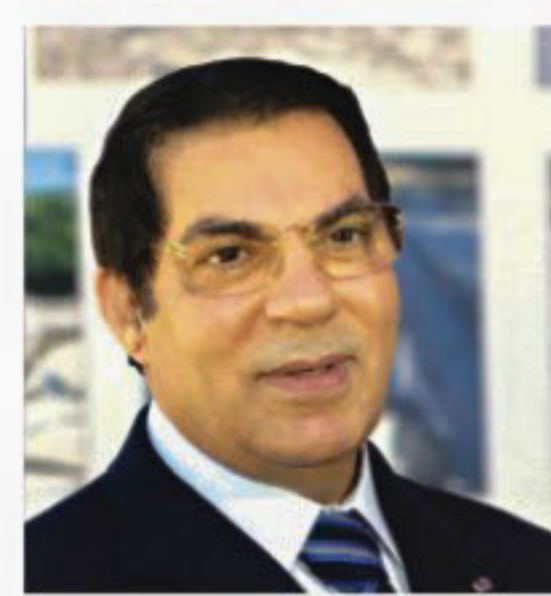
Zine El Abidine Ben Ali

In a televised address, Prime Minister Mohammed Ghannouchi said he would be taking over.