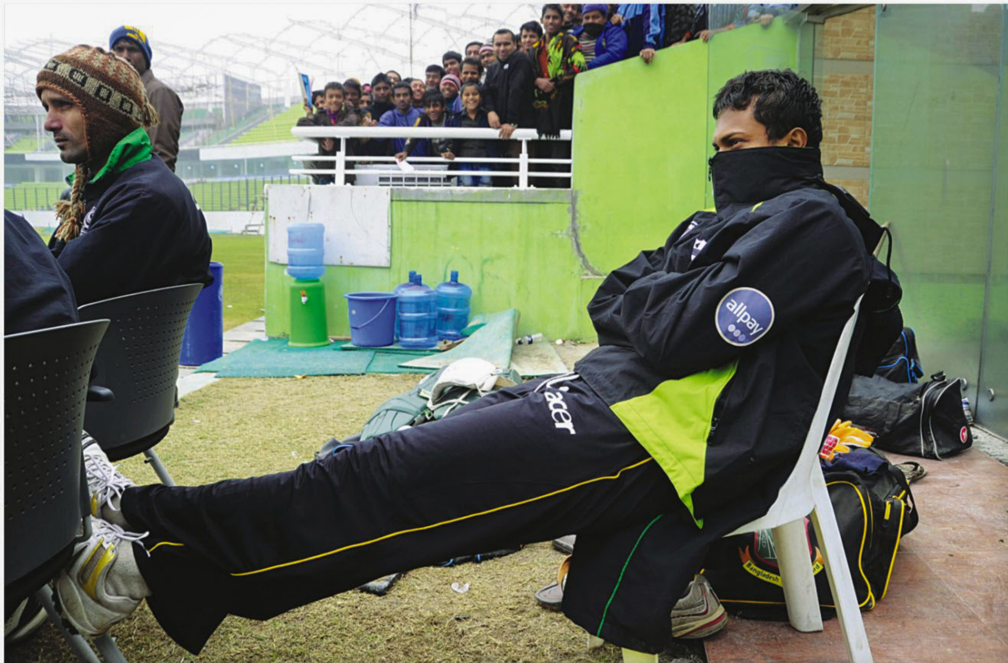
Bangladesh captain Shakib Al Hasan tucks his face into his jacket to stave off the freezing weather during his club Mohammedan's Premier League match against Kalabagan at the Sher-e-Bangla National Stadium yesterday. The mercury dropped to 8.2 degrees Celcius in the city yesterday.