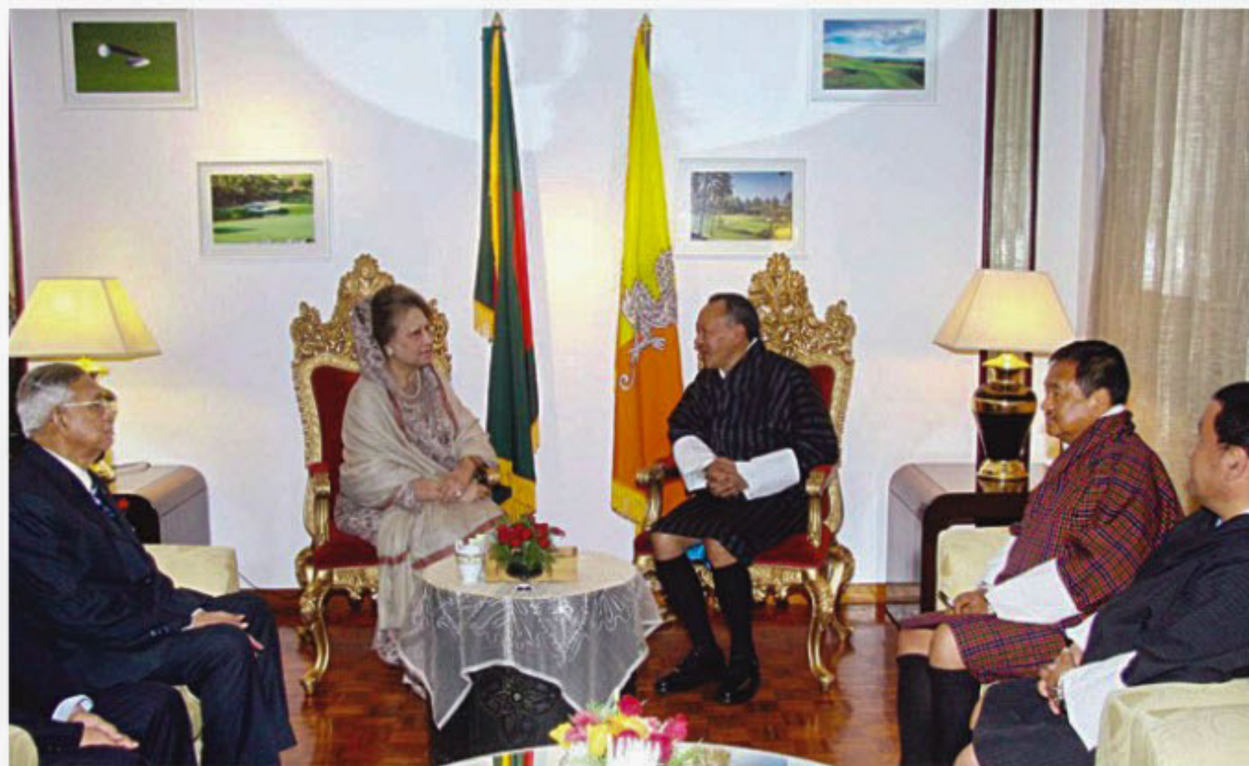
Leader of the Opposition in Parliament and BNP Chairperson Khaleda Zia calls on Bhutanese Prime Minister Jigmi Y Thinley at Sonargaon Hotel in the city yesterday.

The three agreements were signed earlier when Prime Minister Sheikh Hasina visited New Delhi in January last year.