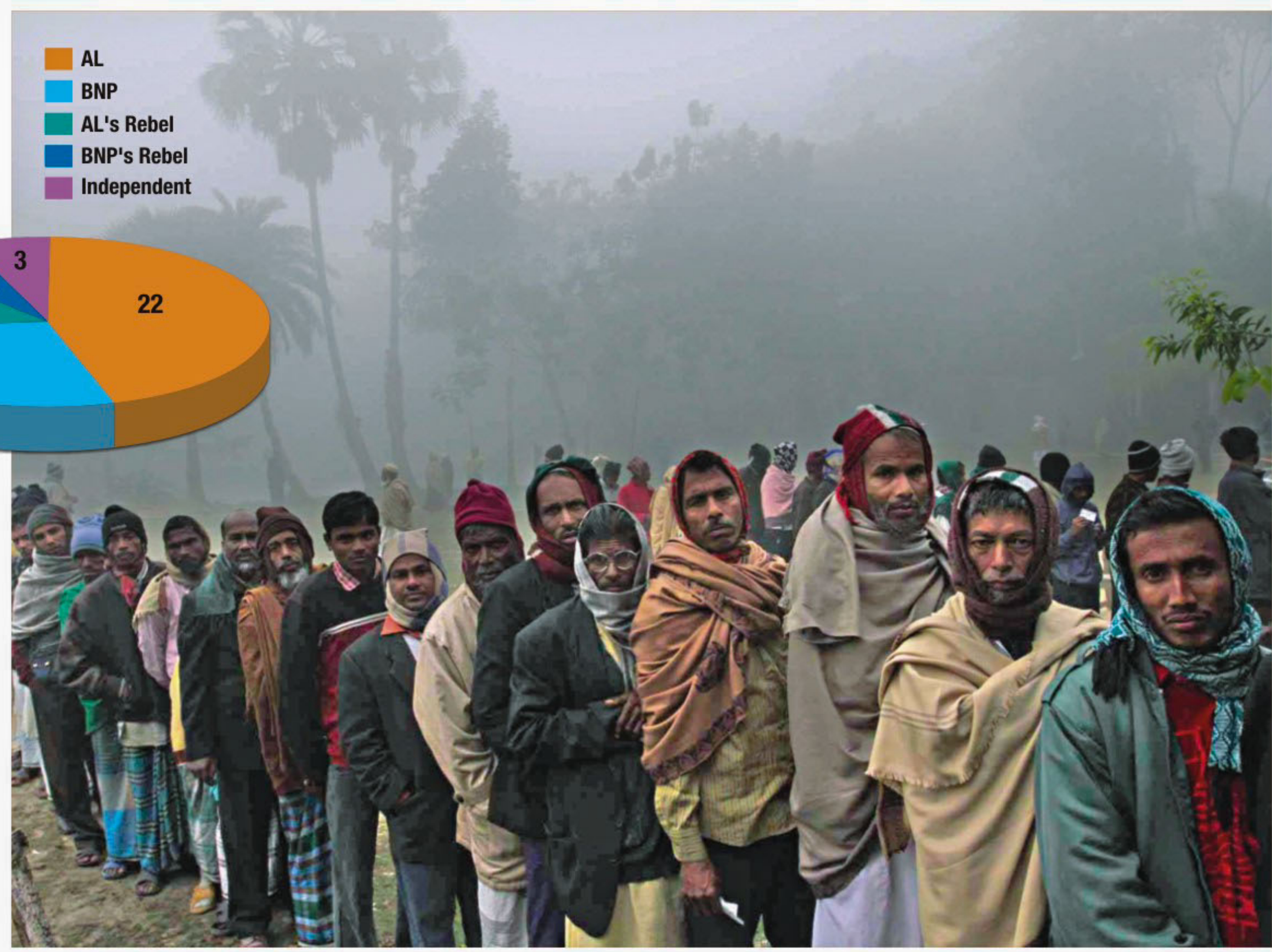
The visibility is poor, the cold is numbing, yet the enthusiasm is high. This photo was taken yesterday at 8:30am in front of Sankarpasha Govt Primary School polling centre of Nalchhity municipality in Jhalakathi. More photos on page 9.