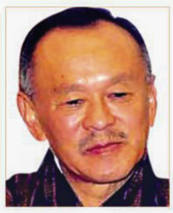
Lyonchhen Jigmi Y Thinley

DIPLOMATIC CORRESPONDENT Bhutanese Prime Minister Lyonchhen Jigmi Y Thinley yesterday came up with an idea of holding a tri-nation discussion among Bangladesh, Bhutan and India to meet Bangladesh's acute demand for electricity. "Why three of us should not discuss how can we meet the needs of Bangladesh sooner than later?" he said while addressing a press conference at Pan Pacific Sonargaon Hotel yesterday evening. Thinley is due to depart Dhaka this morning ending his four-day visit to Bangladesh. Speaking at the press conference, he said currently Bhutan is rather over capacitated with 10 mega hydraulic power projects committed to India, which