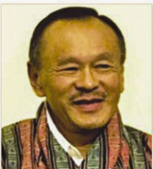
Jigmi Y Thinley

infrastructure, industries and information technology. Asked how many doctors Bhutan is planning to recruit from Bangladesh, he said it would be nice if 25-30 doctors could be recruited on yearly basis for the next three years. Some of these doctors will be highly specialised and some general doctors with 5 years' experience. Asked whether the theory of Gross National Happiness (GNH) can be applicable for Bangladesh as well, Thinley said many of the programmes of the Bangladesh government are creating conditions for pursuit of happiness and enabling people to be happy. BSS Adds: The Bhutanese premier said the geographic