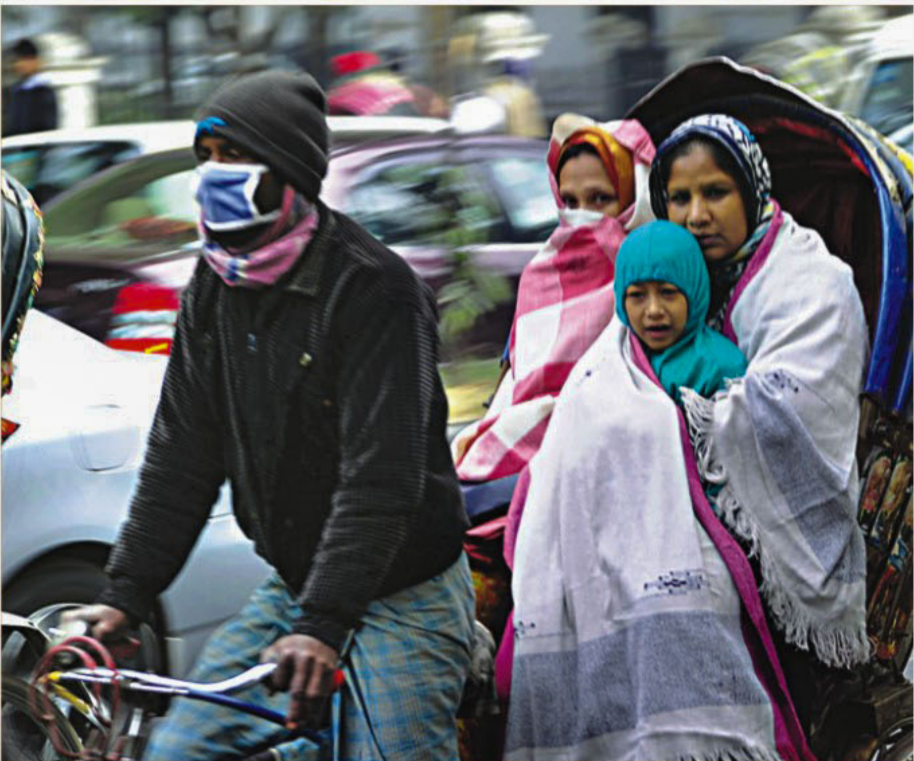
A mother wraps a shawl over her child to keep them warm in the cold during a rickshaw ride in front of Curzon Hall at Dhaka University yesterday.

Denmark Ambassador in Dhaka Svend Olling yesterday said Bangladesh was recognised as a model nation in mitigating and adapting to climate change at the Copenhagen climate change summit last year. He said this when he called on Foreign Minister Dr Dipu Moni at her office. Ambassador Olling said his government viewed relations with Bangladesh as excellent.