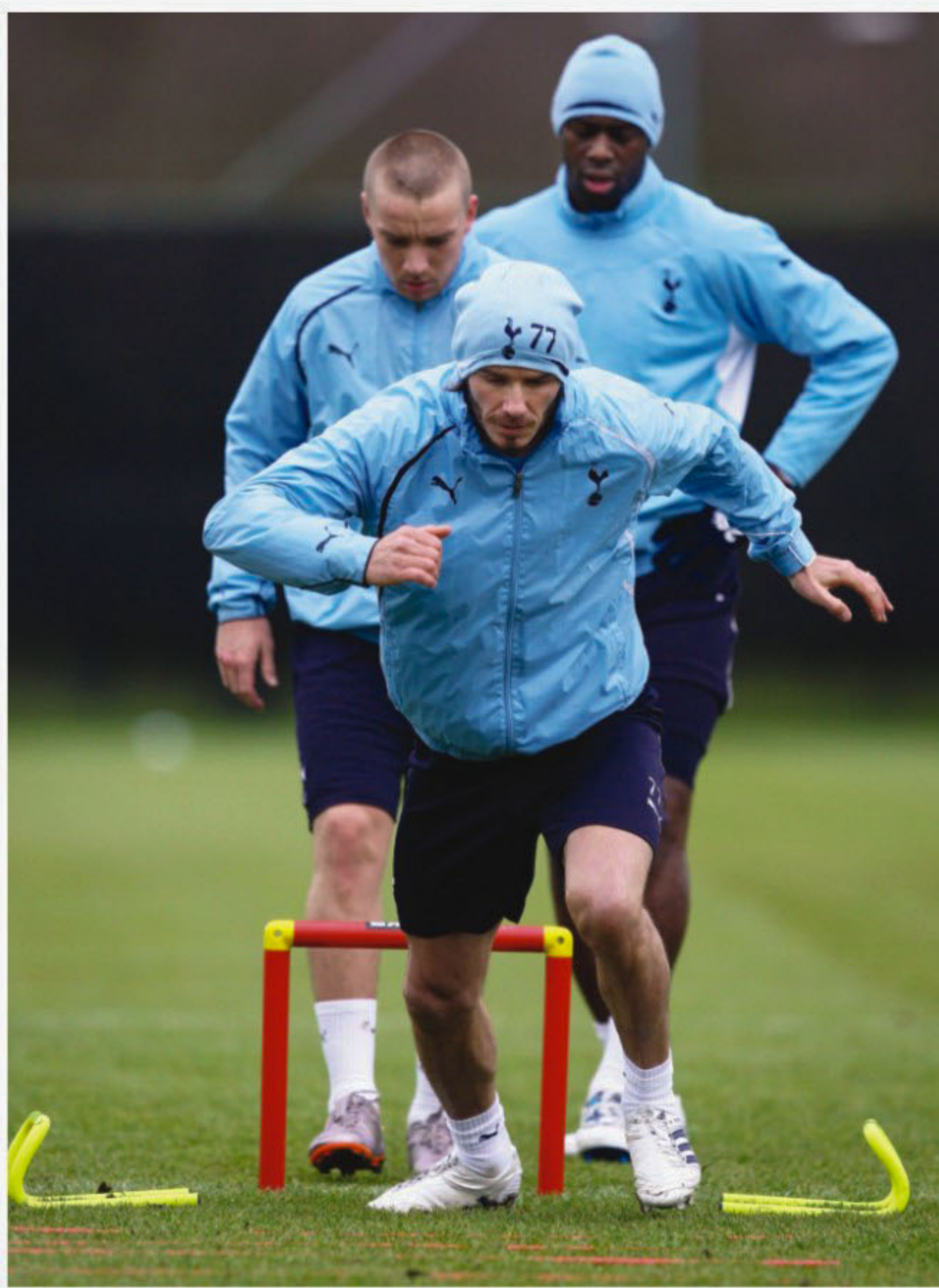
English star David Beckham trains with Tottenham at the Spurs Lodge complex on Tuesday.

"Kenny Dalglish is a legend and a very important man for this club."