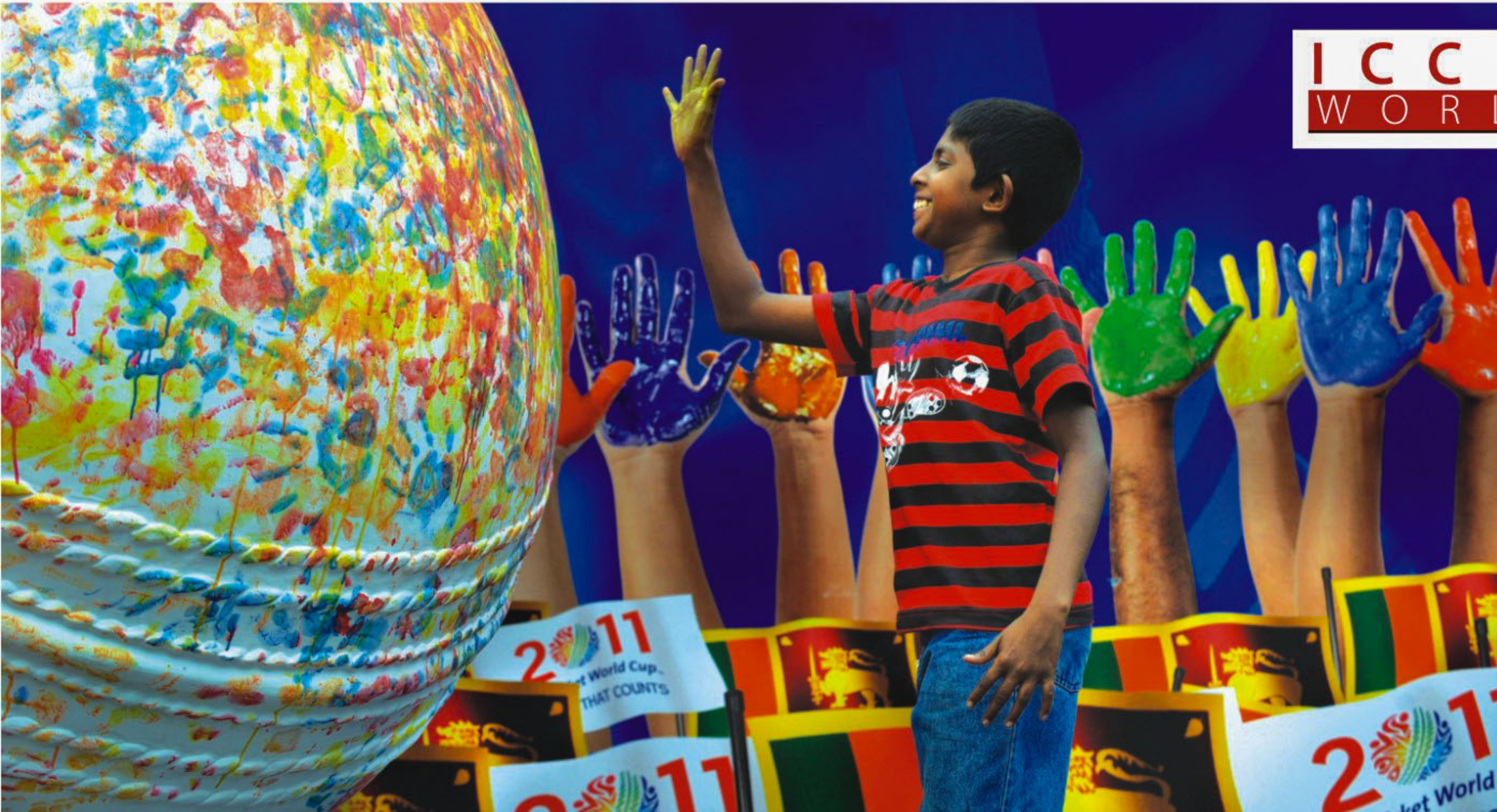
IS THE WORLD CUP HAPPENING IN BANGLADESH? A youngster in Colombo imprints his palm on a giant white cricket ball that is touring the island to drum up public support ahead of the World Cup. Bangladesh is also a co-host but apart from a roadshow running across the country, there isn't much to show for. A lot can be done, given cricket's immense popularity, but action is in short supply from the authorities concerned.