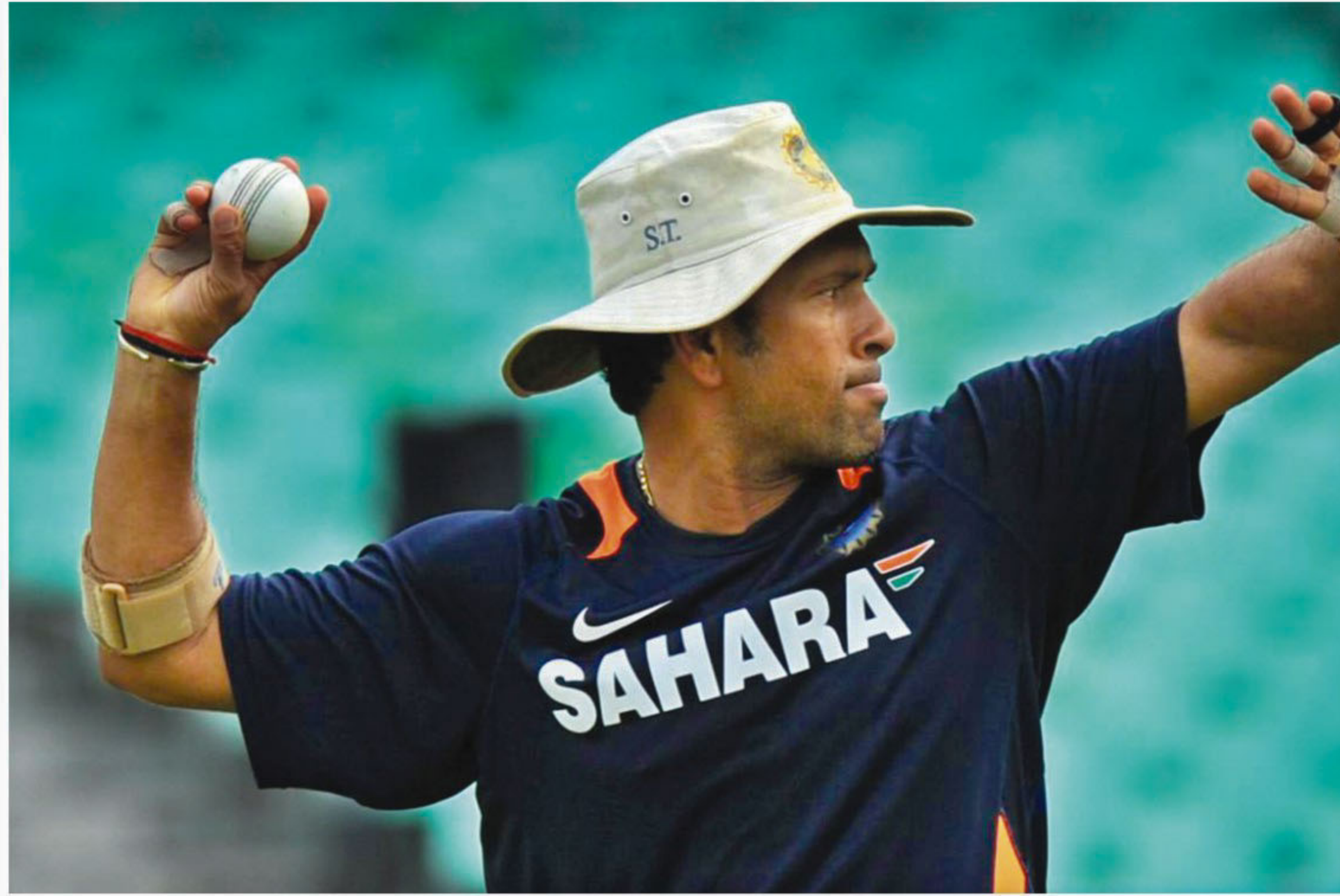
Sachin Tendulkar practises throwing the ball during a training session at Kingsmead Stadium in Durban yesterday ahead of their first ODI against South Africa that will be played today.