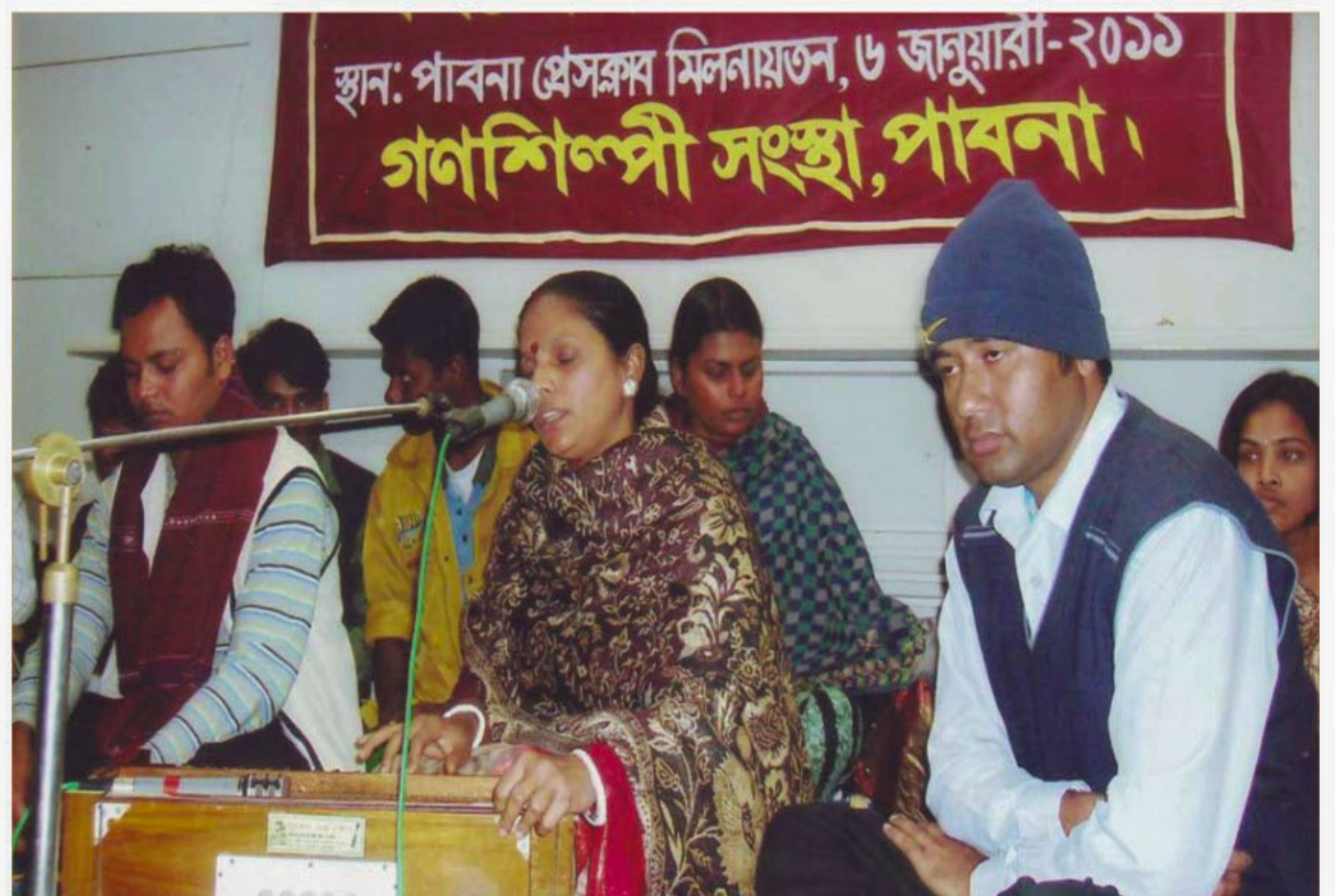
An artiste of Gonoshipili Shangshtha sings at the event.