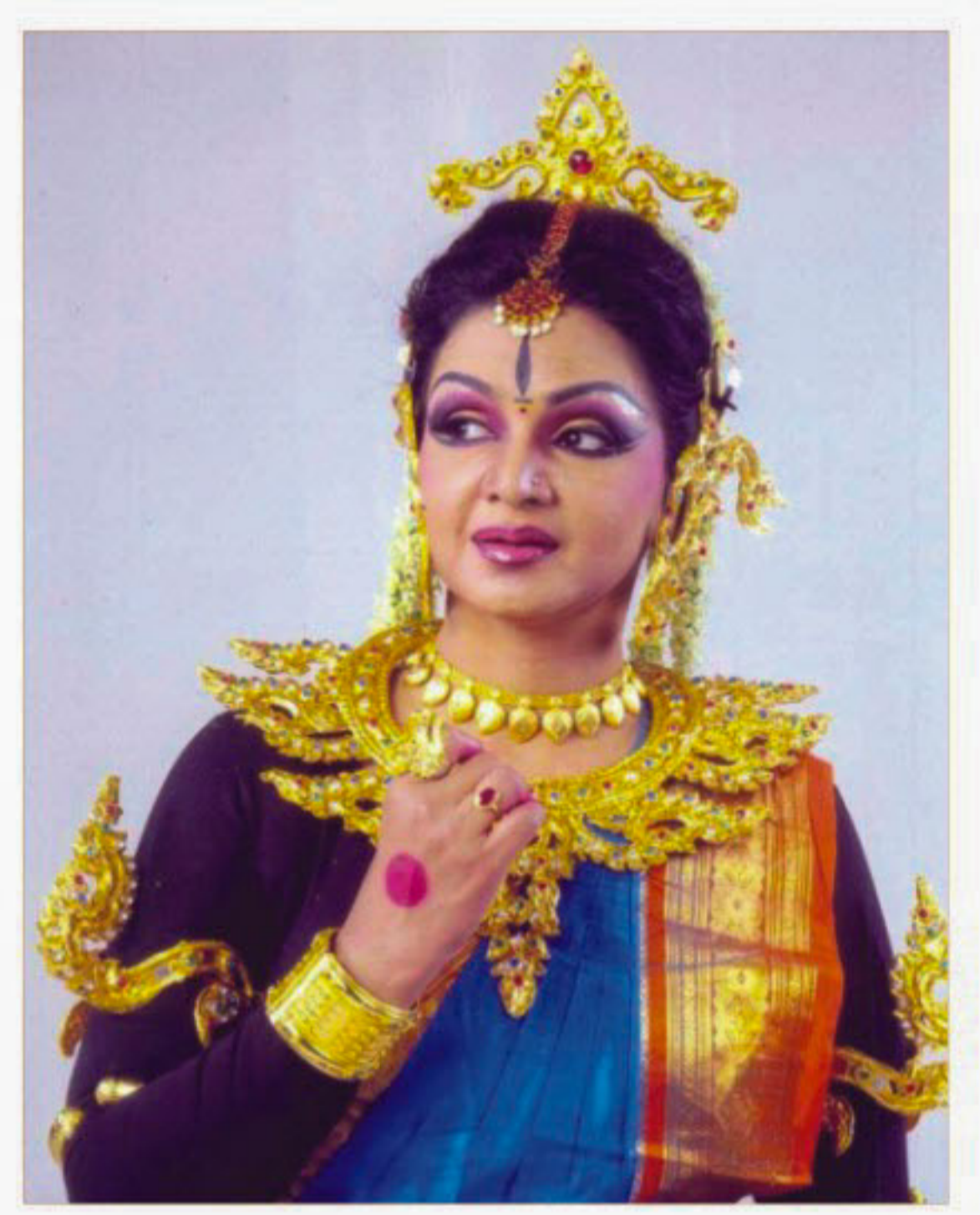
Bharatanatyam pieces at the event. Cards will be available at the venue, on the day of the show, starting from 3pm. The programme will begin at 6:30pm and continue till 9pm.

The Daily Star turns 20 on January 14. We set out on our journey with a sense of challenge and a feeling of humility to serve this nation as a truly independent newspaper. Over these last two decades you, the readers, have encouraged and supported our endeavours along this track. To mark our 20th anniversary, we have chalked out a range of special programmes. We believe the celebration will not be complete without you. On January 15, 2011, The Daily Star will be holding a Classical Night at National Theatre Hall, Bangladesh Shilpakala Academy, Dhaka. The soiree will highlight light and semi-classical vocal performances by accomplished singers as well as classical dances. Around 60 dancers -- both leading and emerging -- from Dhaka, Sylhet and Chittagong will present Kathak, Manipuri, Odissi and