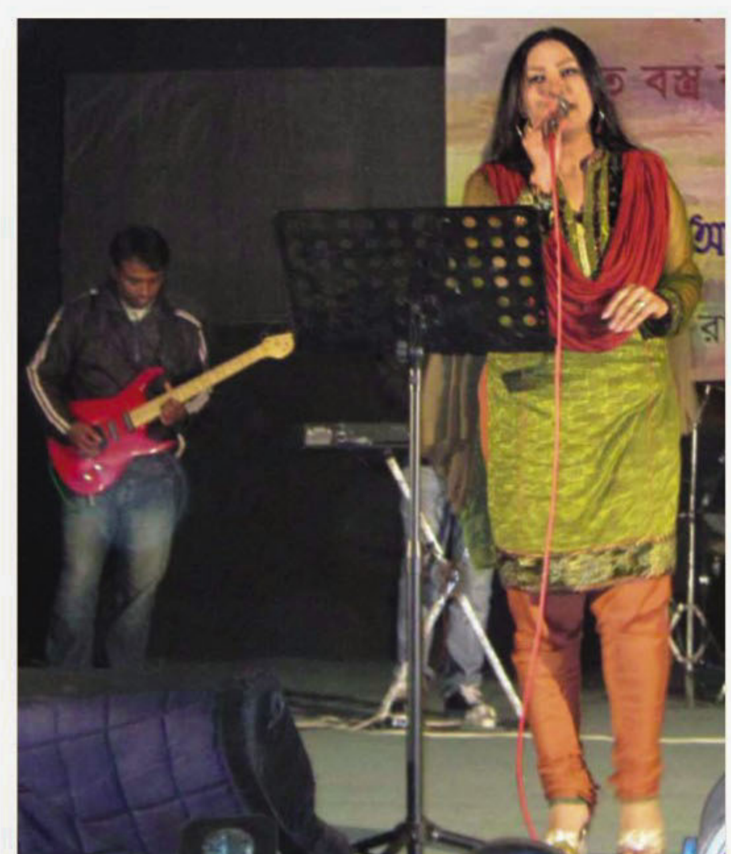
A performance at the programme.