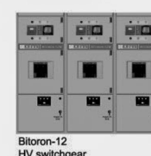
Bitoron-12 HV switchgear