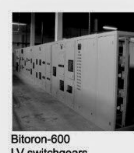
Bitoron-600 LV switchgears