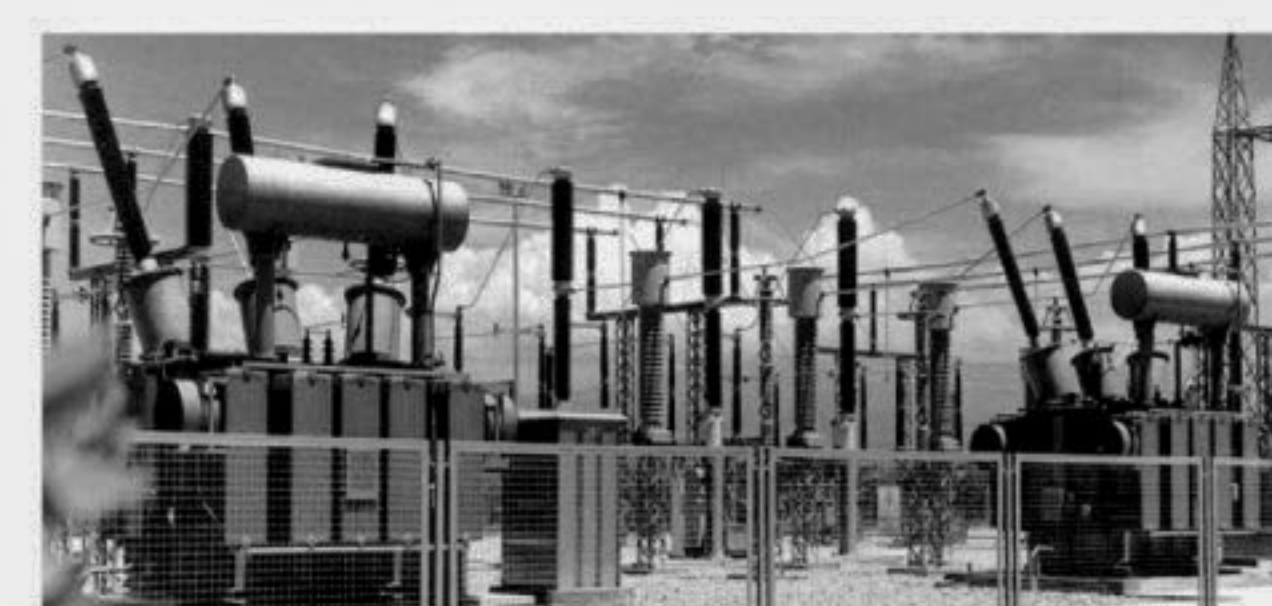
132kV/11kV 50MVA Substation