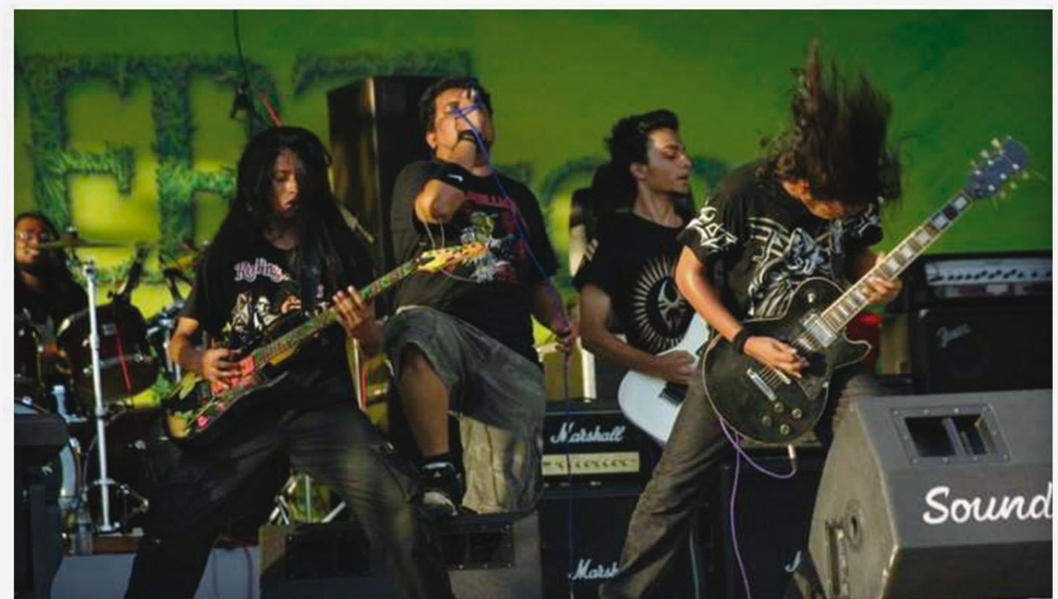
Power Surge performs at 'Concert for Sundarbans'.

making tracks from the album favourites on a playlist. The cry for a proper concert venue was lessened, as the Army Stadium hosted a couple of grand rock concerts, organised in association with BAMB. Popular bands came together, to generate awareness in causes like voting for the Sundarbans to get it on the list of 'Natural Wonders' and putting an end to sexual harassment.