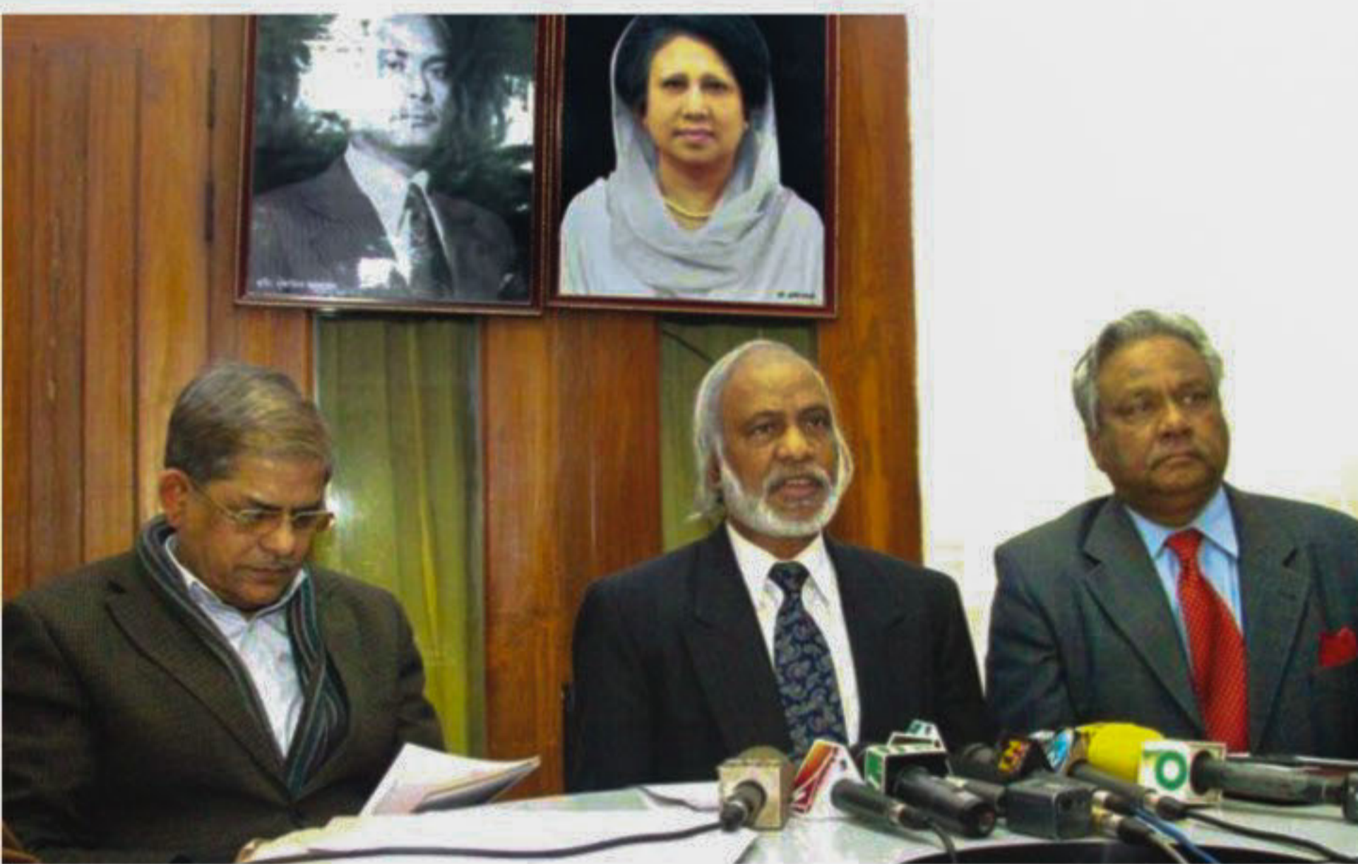
BNP Standing Committee Member Abdul Moyeen Khan, second from left, speaks at a press conference in the city yesterday. On his right is BNP Senior Joint Secretary General Mirza Fakhrul Islam Alamgir and on his left is former education minister Osman Faruque.

The result will be available on www.nu.edu.bd; www.nu-ba.info; www.nu-bsc.info; and www.nu-bbs.info. Students can also send 4636 from any mobile number writing 'nu AT rollNo' in the message text.