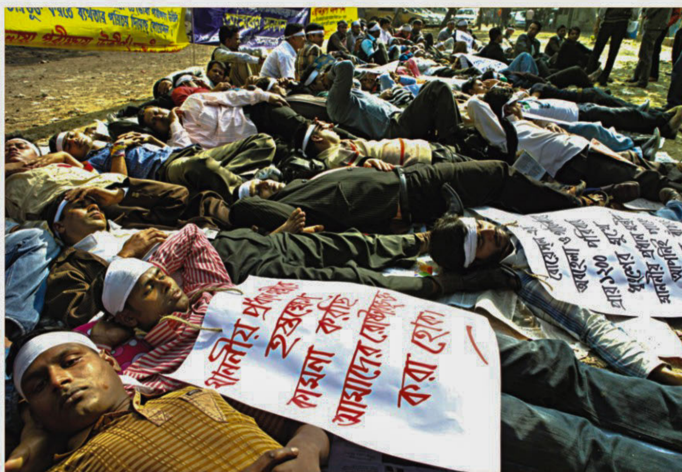
Some 500 aspirant migrant workers to Korea begin a hunger strike at Muktangan in the city yesterday, as the state-run recruiting agency BOESL dropped their names from the list.

He also paid rich tributes to Father of the Nation Bangabandhu Sheikh Mujibur Rahman and recalled that the then Bhutanese King had felt proud of his personal acquaintance with Bangabandhu, whom he considered as one of the world's greatest leaders.