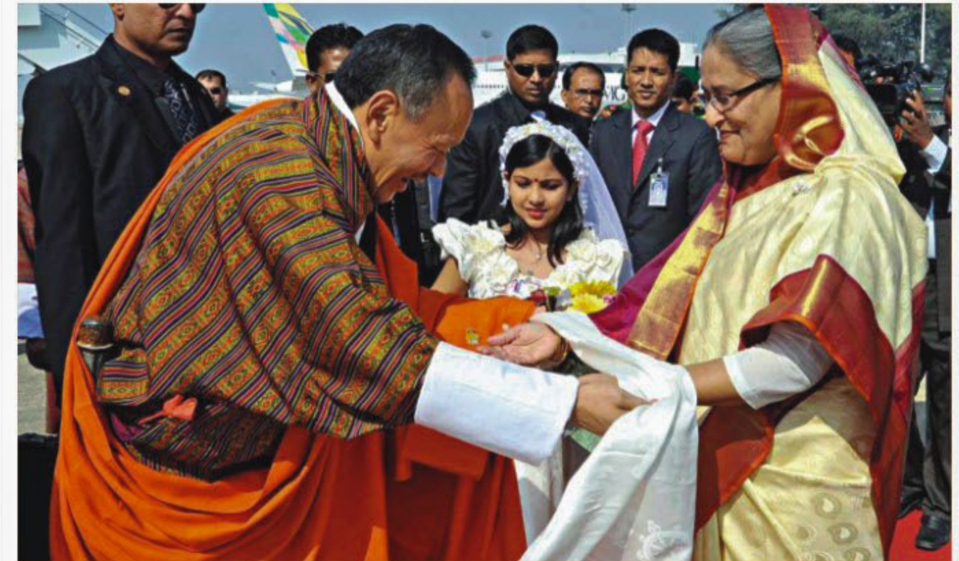
Prime Minister Sheikh Hasina greets her Bhutanese counterpart and Saarc Chairman Jigmi Y Thinley at Hazrat Shahjalal International Airport yesterday on his arrival in the city on a four-day visit.