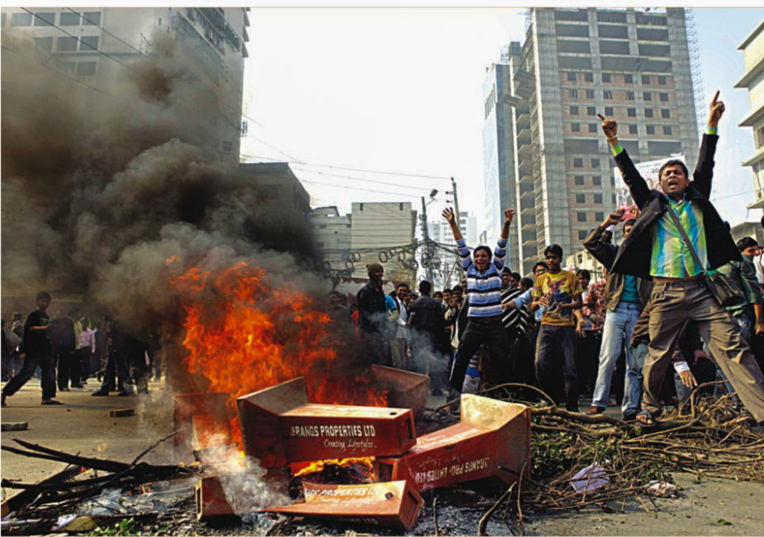
Investors outraged at the collapse of share market demonstrate by burning materials in the city's Paltan area yesterday.