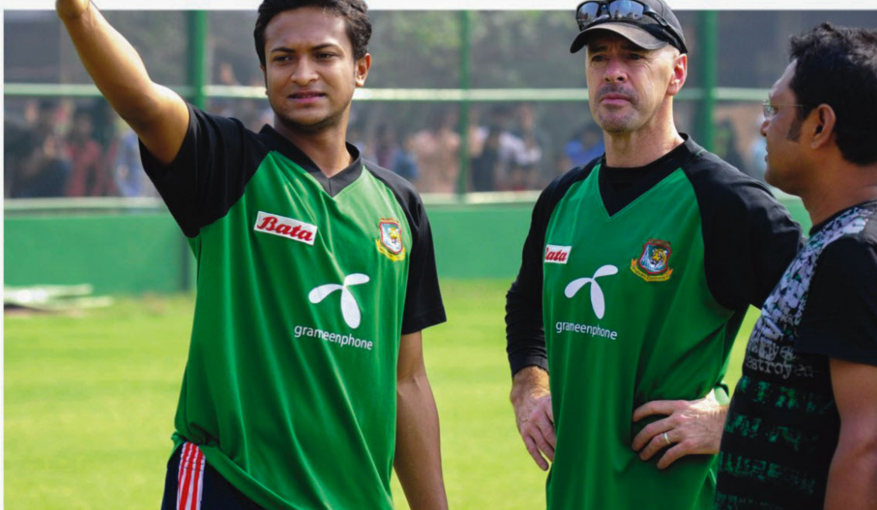
I HAVE A STRONG POINT: Bangladesh captain Shakib Al Hasan (L) shows something to a stone-faced coach Jamie Siddons (C) during a practice session at Academy ground adjacent to the Sher-e-Bangla National Stadium in Mirpur yesterday.