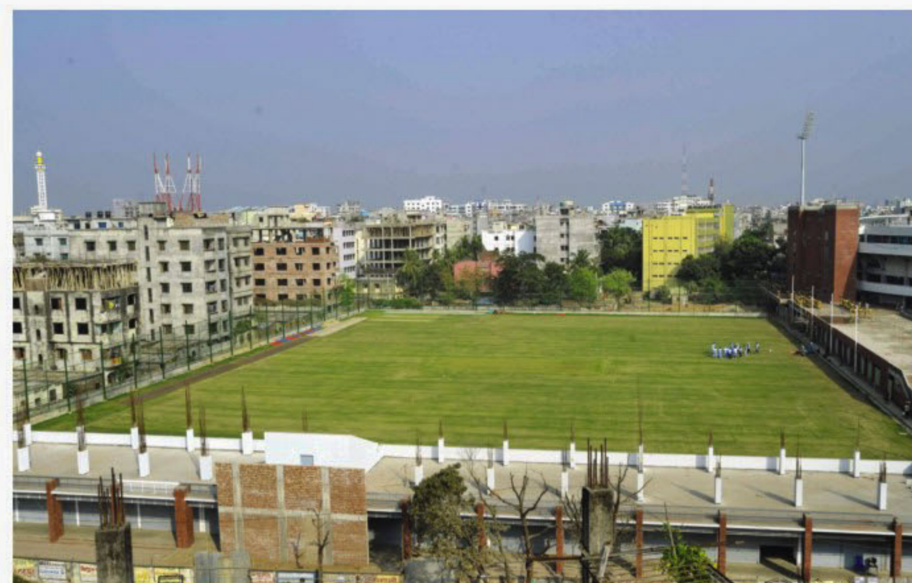
MAKEOVER: This photograph of the GP-BCB National Cricket Academy was taken recently. The greenery is eye-catching and a surprise as it was in a barren state for many years.