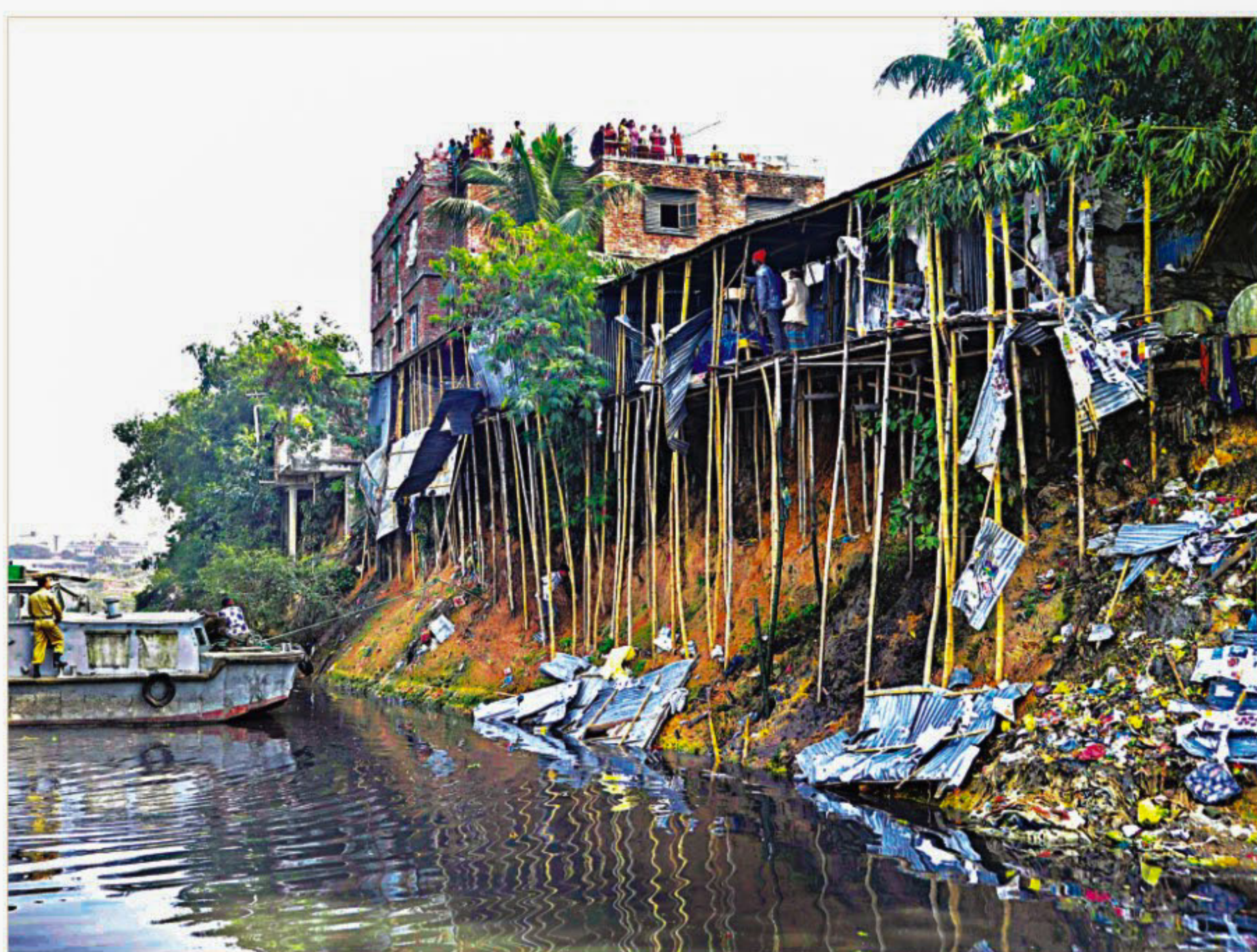
BIWTA in association with Dhaka district administration knock down seven illegal structures on the Turag to the west of Tongi Bridge yesterday. The drive that started in the morning stopped only because it was too dark to continue. A lot of media hype is generated through these drives but a few days later the occupiers almost always return.