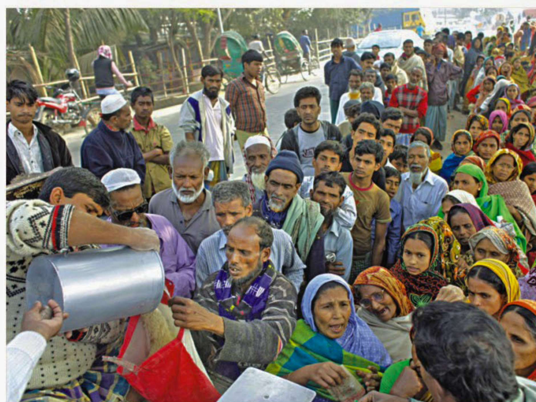
People gather at an Open Market Sale (OMS) point in the city's Lalbagh area to buy rice at subsidised price yesterday.