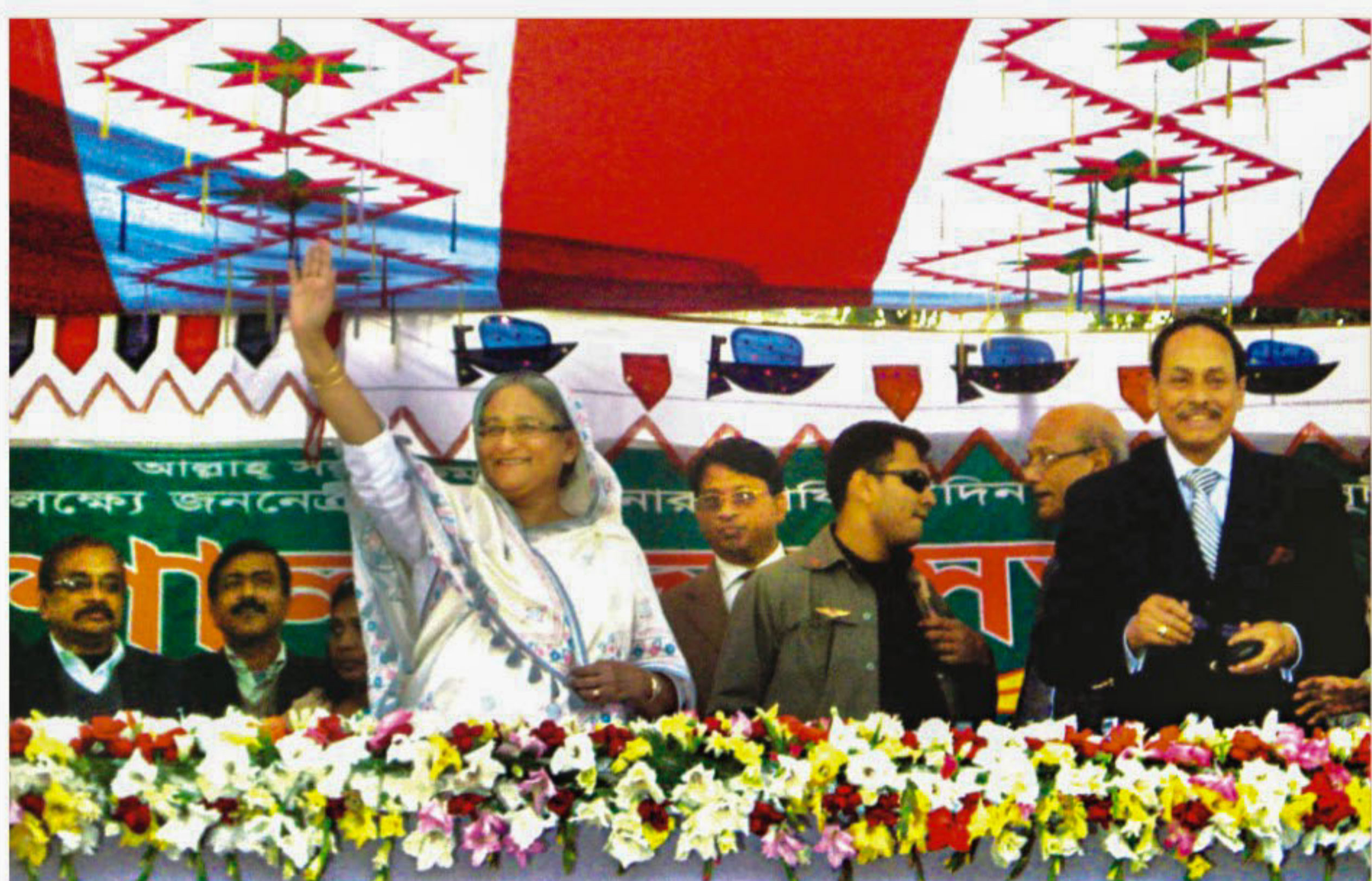
Prime Minister Sheikh Hasina waves at a public meeting in Rangpur yesterday. Jatiya Party Chairman and local lawmaker HM Ershad is also present.