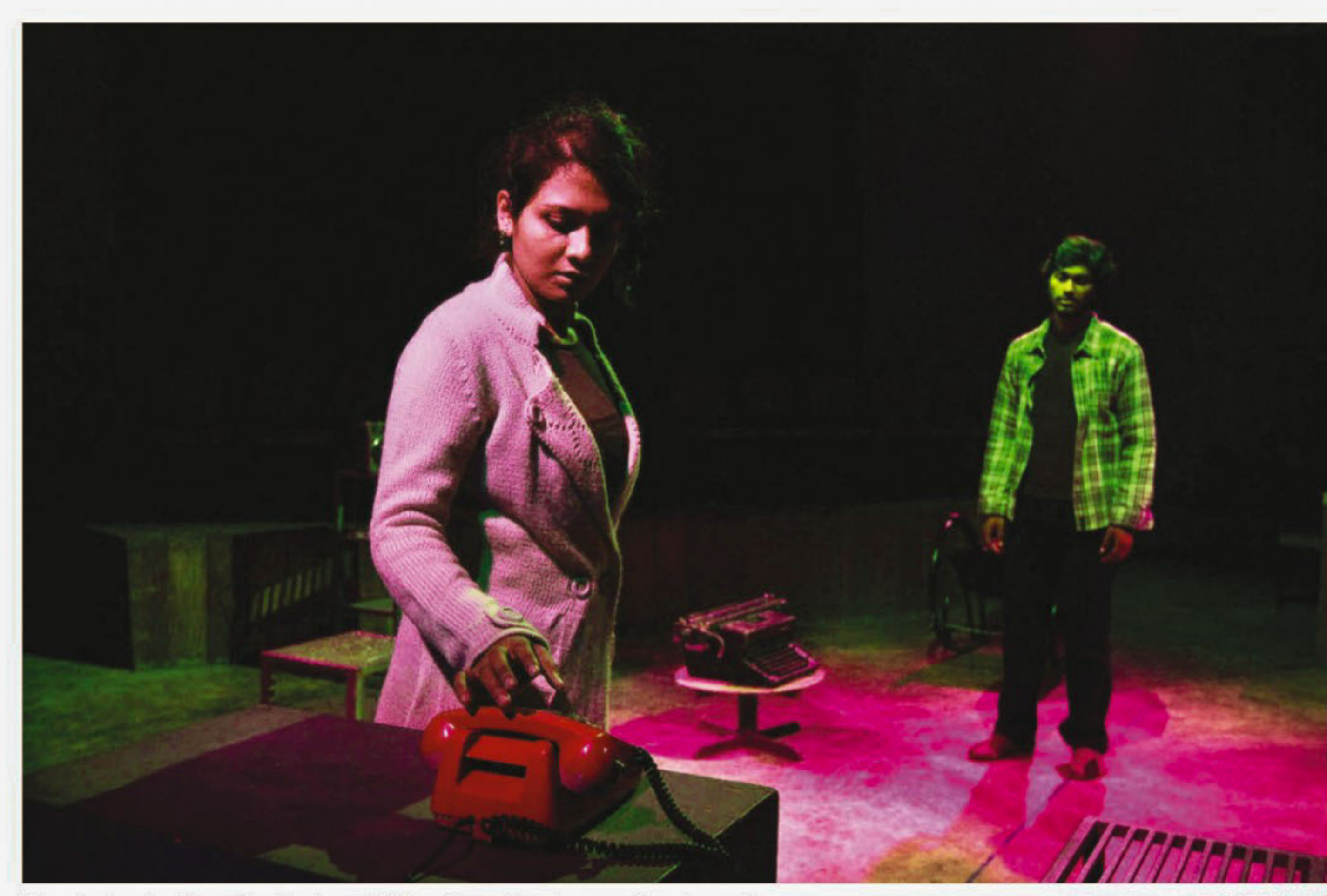
The play is about people who do not follow the paths of conventional morality.