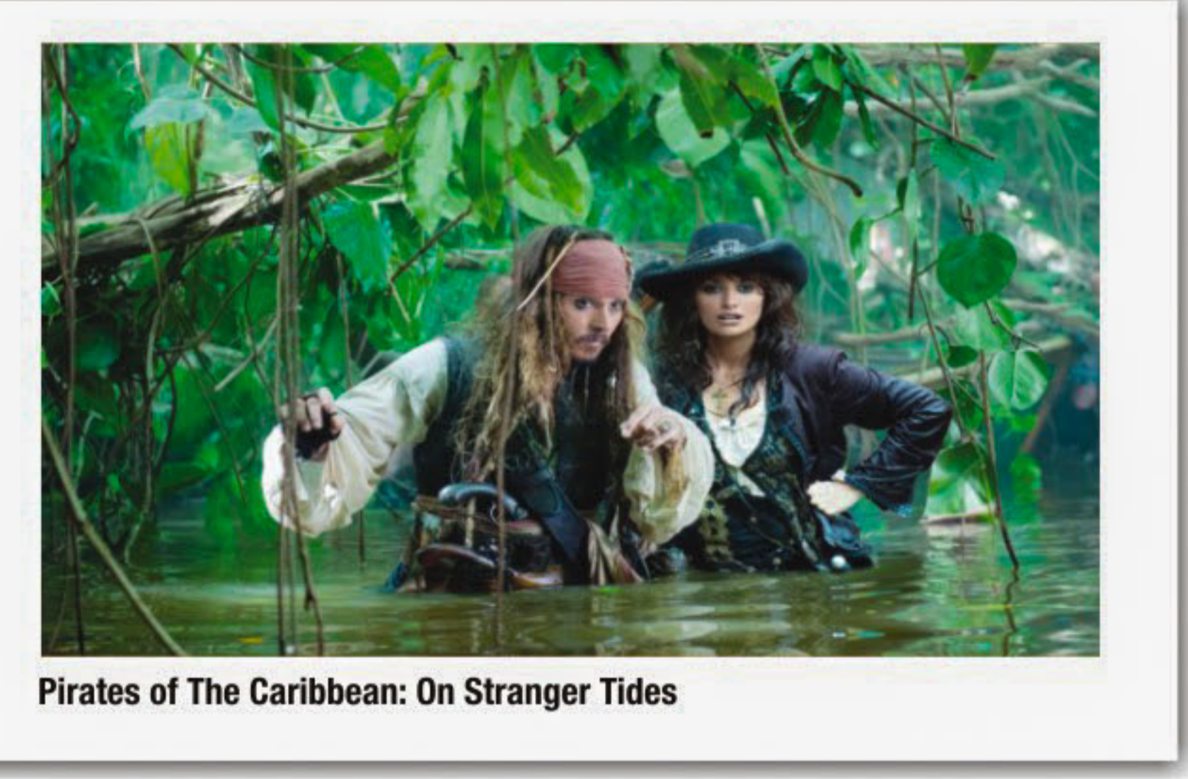
Pirates of the Caribbean: On Stranger Tides

Let's be clear, we aren't remotely talking arthouse fare here. We aren't talking about nuanced little films, subtle emotional undercurrents, victory through silences... We're talking popcorn-fueled explosions, unashamedly larger than life. Blockbusters that make our jaws drop with their mega-budget magic. So here then are ten mammoth 2011 releases that have us drooling: