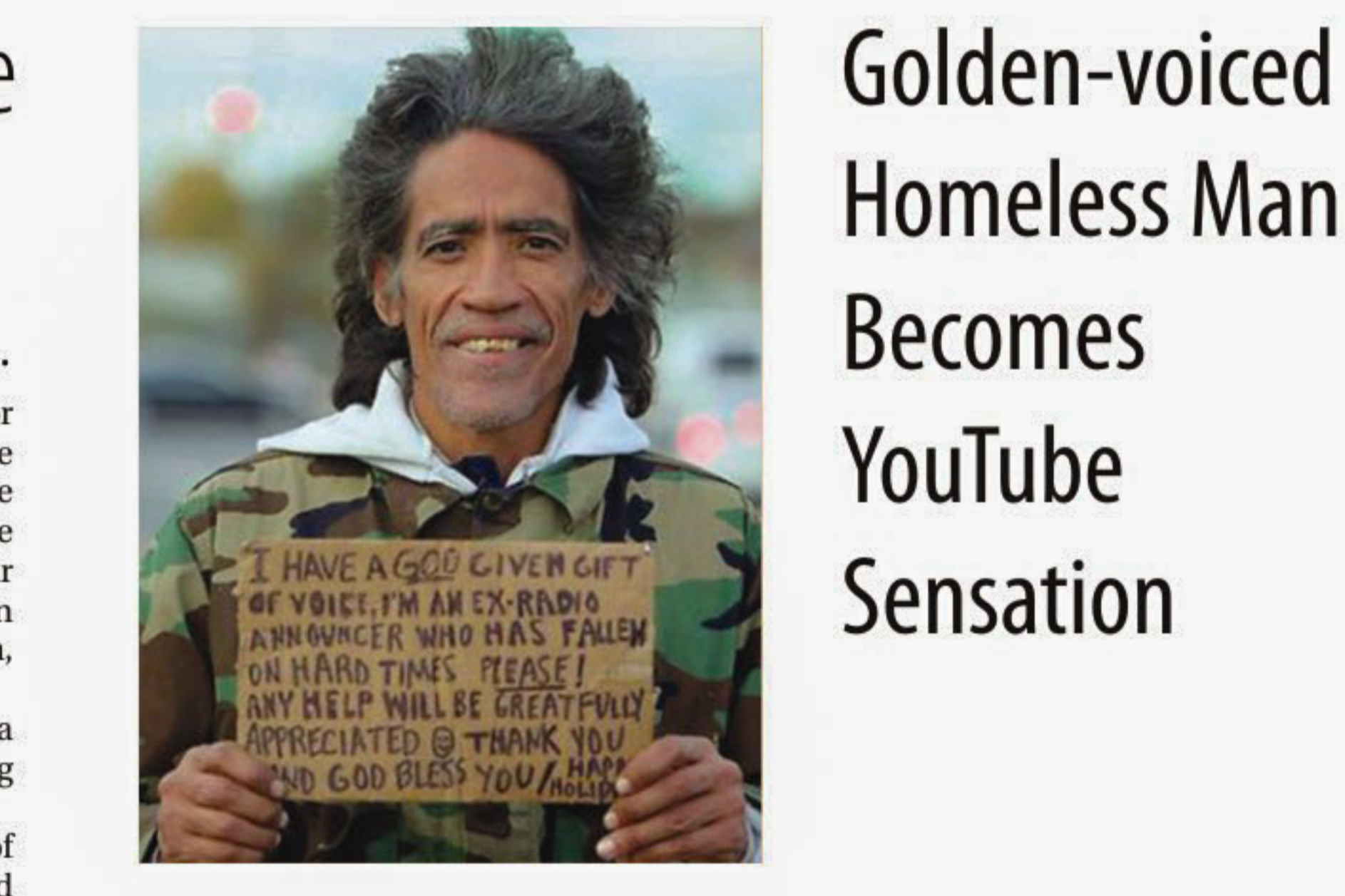
One of the first viral videos of 2011 has propelled a homeless American man, who was filmed begging for money with a baritone-rich radio voice, to international attention and attracted numerous job offers.

Golden-voiced Homeless Man Becomes YouTube Sensation He recounted his days working as a radio DJ in the 1980s before battling drugs and alcohol. By 1993, he found himself in homeless shelters and even served time in prison. He tearfully reunited with his elderly mother in New York recently, in front of several news crews. He told "Today" he became known among drivers in Columbus, Ohio who would drive by just to hear his golden voice and upbeat greeting while advertising his "God-given gift of voice" when panhandling. But now, with job offers pouring in, he said he hoped five years on he could become a radio programme director and support his daughters and sons in Columbus. The lesson on treating the homeless, he said, was simple: "Don't judge a book by its cover, everybody has their own little story." Source: Internet