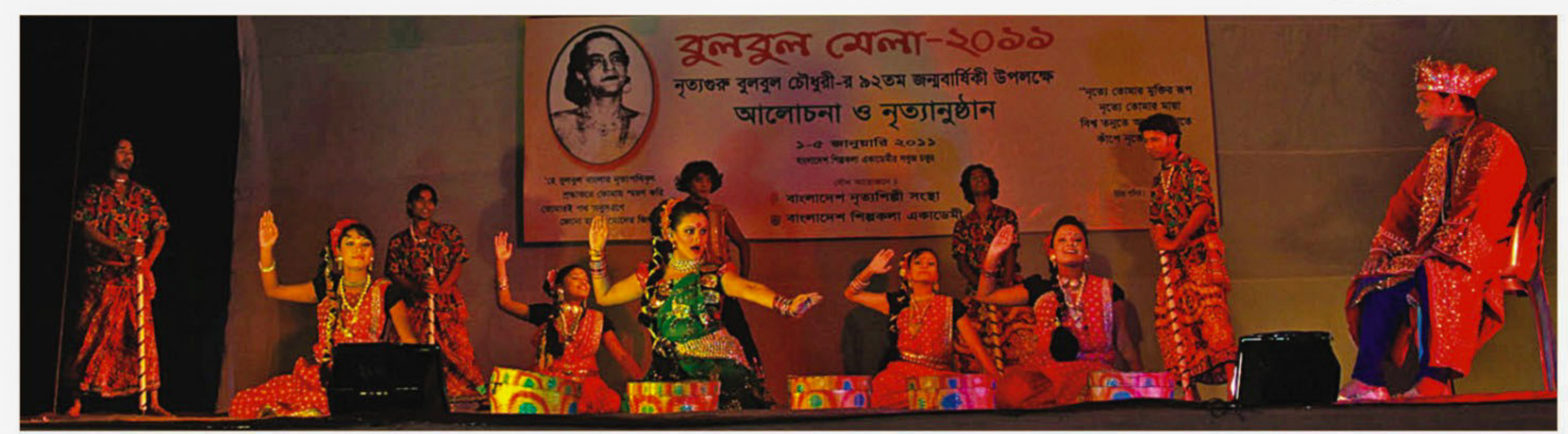
Elaborate discussions on the life and works of Bulbul Chowdhury and dance performances dedicated to the memory of the Nriyaguru are highlights of the celebration.