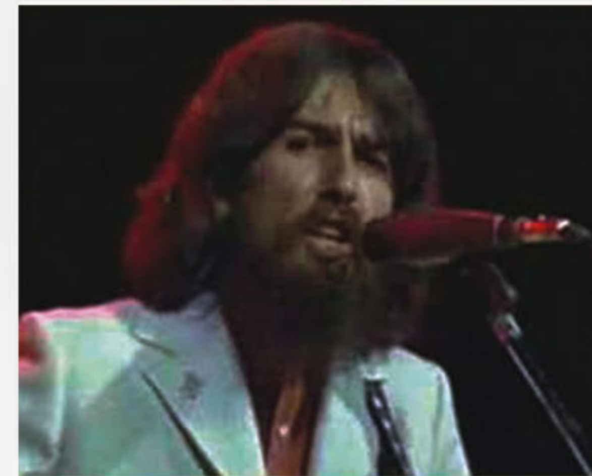
The video of George Harrison's "Bangladesh" was screened at the event.