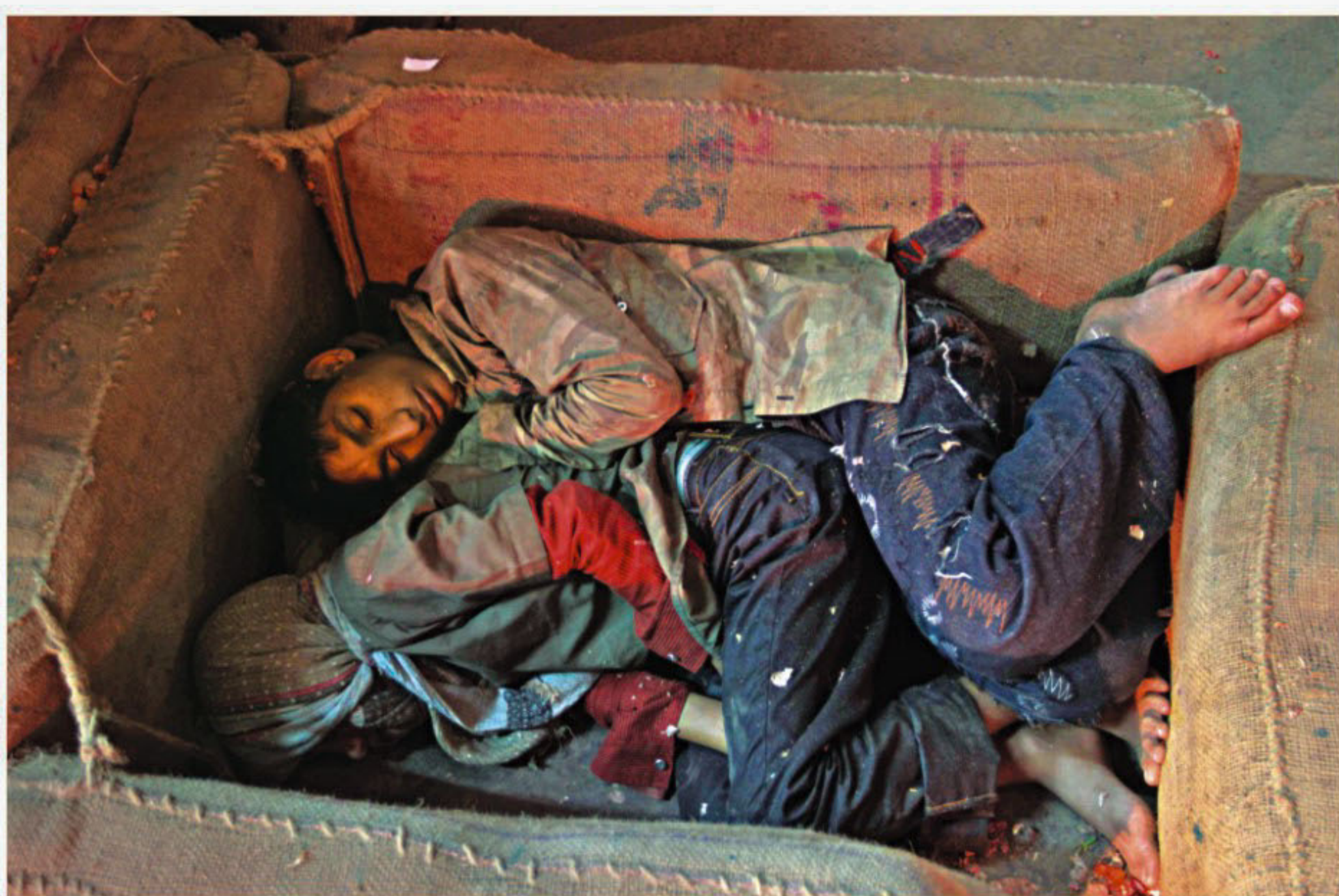
Two street children sleep in a makeshift enclosure made with sacks of onions, trying to save themselves from last night's biting cold at Karwan Bazar in the capital.