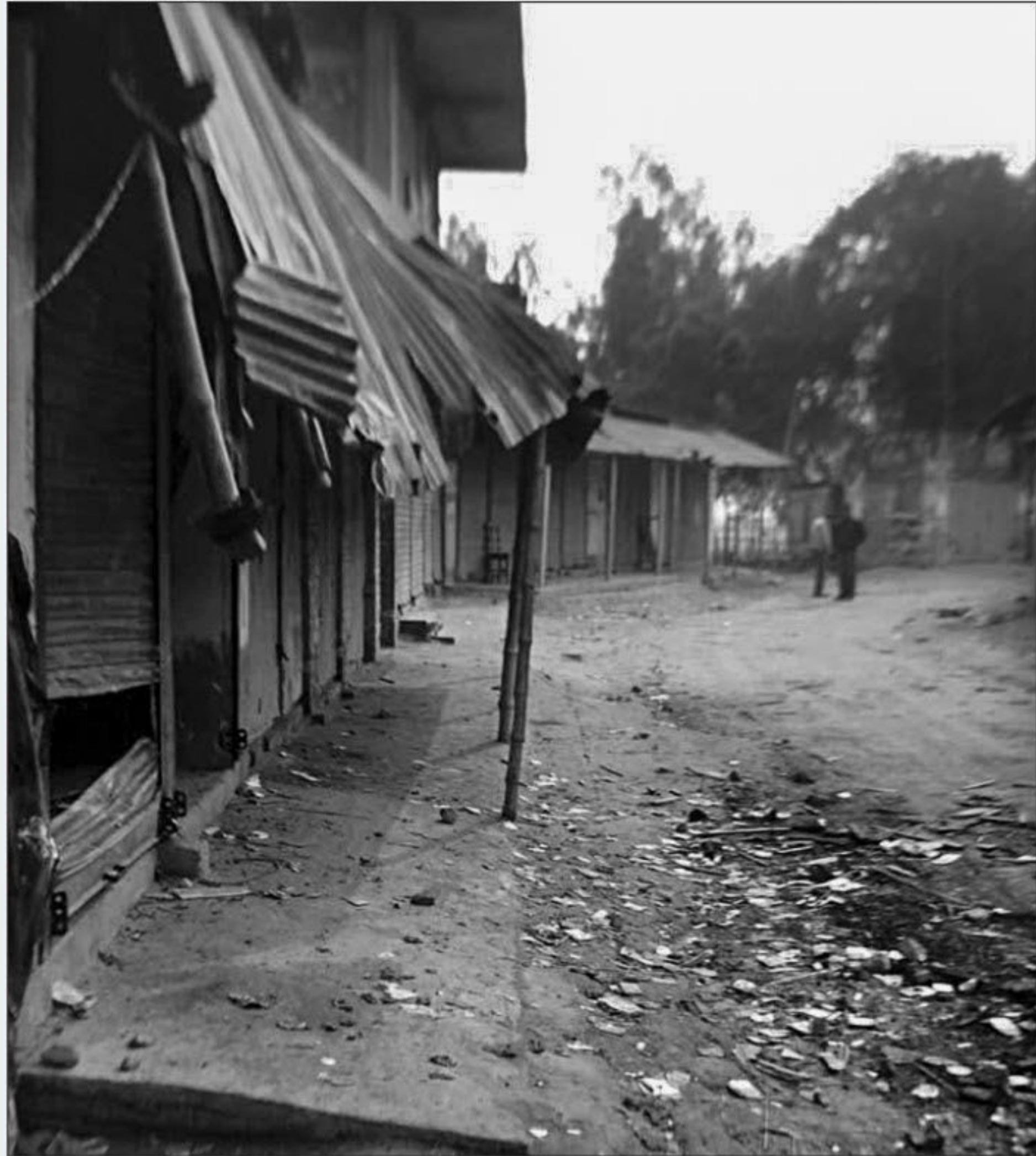
Seven villages around Barapukuria coal mine give a deserted look as residents remained indoors since Saturday. The law enforcers restricted movement of people in the area after a series of factional clashes between land subsidence victims.

People of seven villages remained indoors since Saturday's violence, he added.