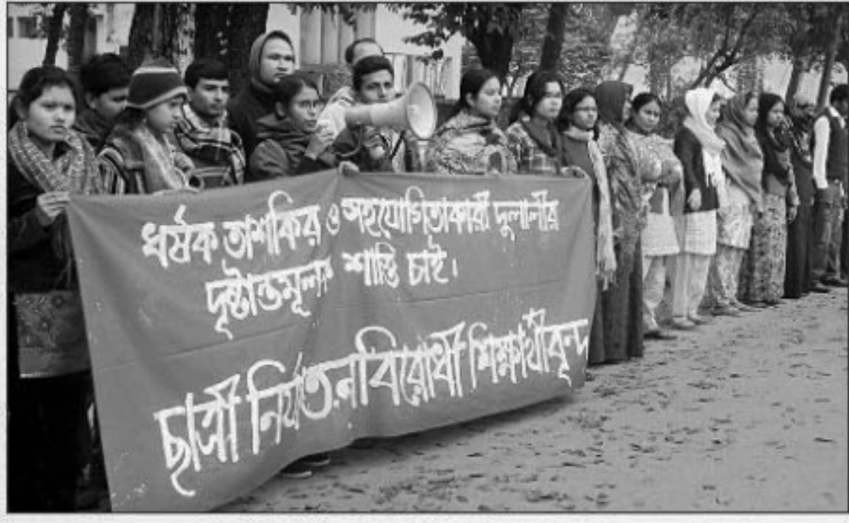
Carmichael College students in Rangpur yesterday formed a human chain demanding punishment to the rapist of a student of Bangla department on December 20.