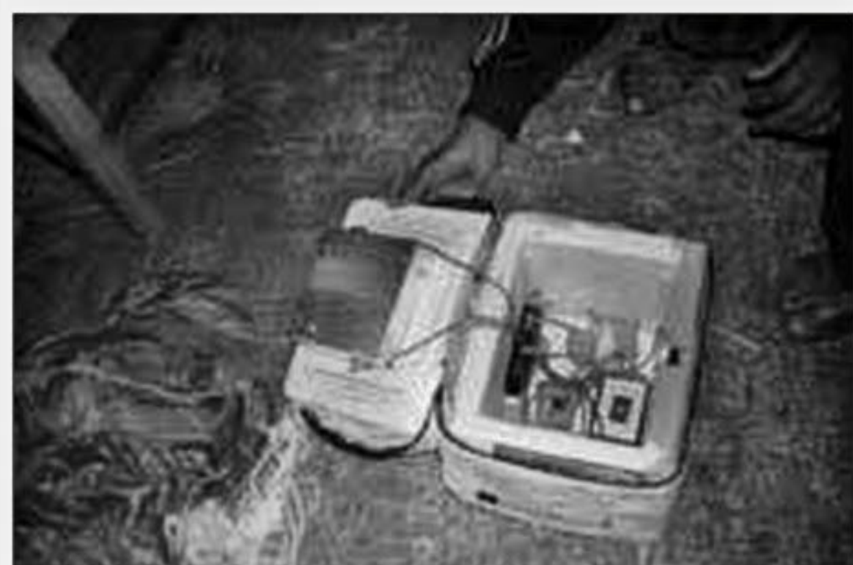
This box containing electronic devices with English and Hindi inscriptions indicating it to be of Indian Space Research Centre in Kolkata landed on the premises of Charpara Primary School in Shaikupa upazila of Jhenidah district on Saturday evening.