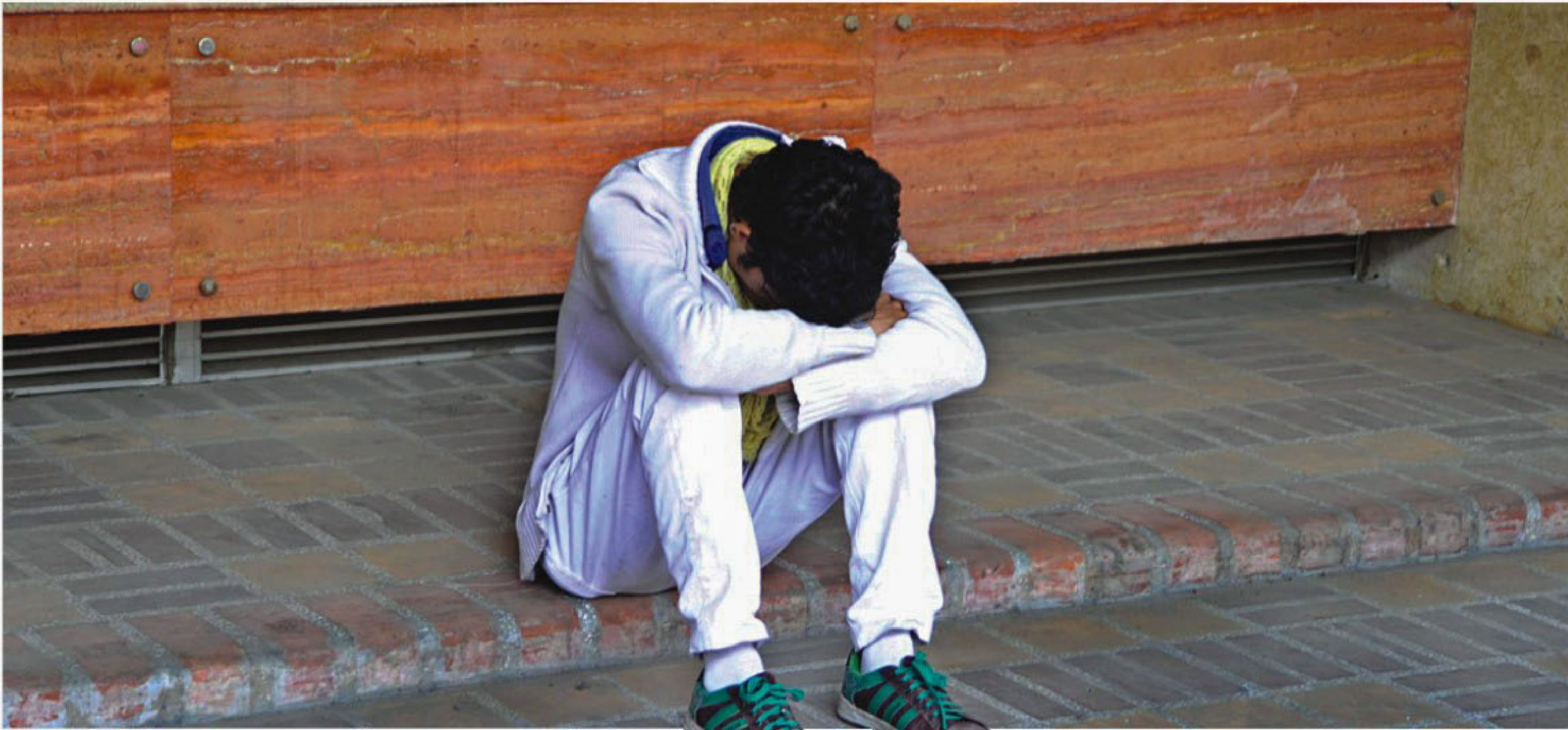
A young cricket fan sits glumly after failing to get a World Cup ticket from the City Bank branch near Science Laboratory in the capital yesterday. He had been queuing since Saturday afternoon.