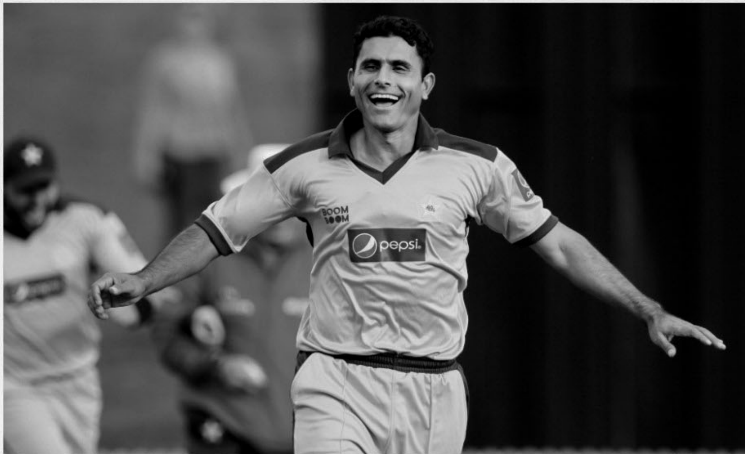
Pakistani allrounder and Man-of-the-Match Abdul Razzaq celebrates the wicket of New Zealand opening batsman Jesse Ryder for a duck during their victory in the third Twent20 match at Seddon Park in Hamilton yesterday.

SCORES IN BRIEF PAKISTAN: 183 for 6 (Shehzad 54, Razzaq 34 not out, Hafeez 34, U.Akmal 30; Franklin 2-12, N.McCullum 1-29, Milne 1-48) NEW ZEALAND: 80 all out in 15.5 overs (Styris 45; N.McCullum 8; Afridi 4-14, Razzaq 3-13)