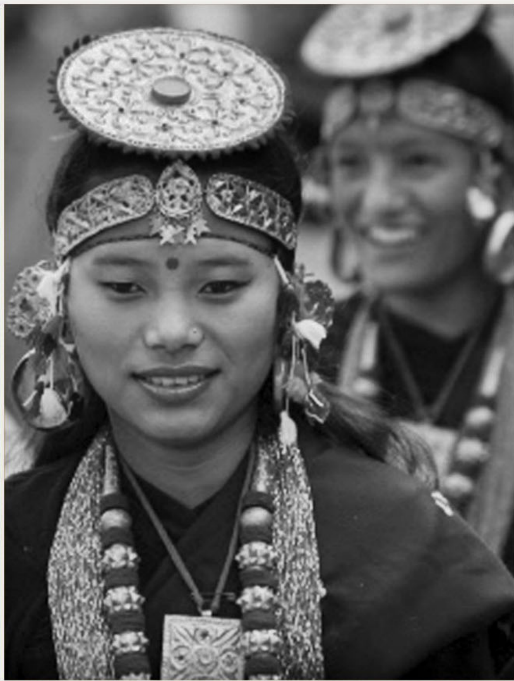
A Nepalese indigenous Gurung community member in traditional attire takes part in a New Year's celebration ceremony in Kathmandu on December 30, 2010. The ethnic group are indigenous people of Nepal's mountainous valleys and have a population of 700,000, or three percent of the Himalayan nation's population.

"We are open to cooperation based on our rights," he said, warning Western countries that Iran would give a 'regretting' response to anyone who 'intends to prevent Iran from achieving its rights'.